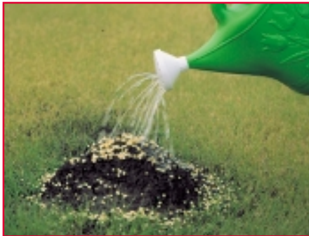
Most granular products contain an insecticide that releases into the soil when drenched with water.