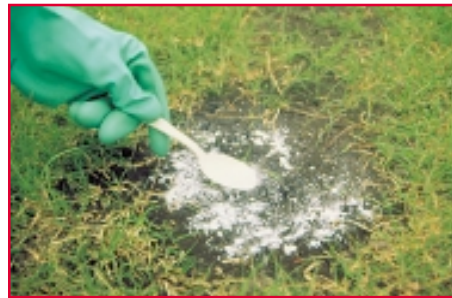
Dry dusts are convenient and easy to apply.