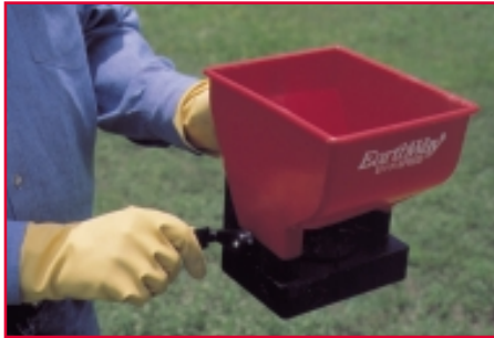
Use a hand-held seed spreader to apply fire ant bait.

tions work well to reduce fire ant numbers the following spring. During winter, fire ants forage little and rarely pick up baits.