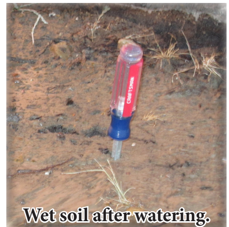
Wet soil after watering.