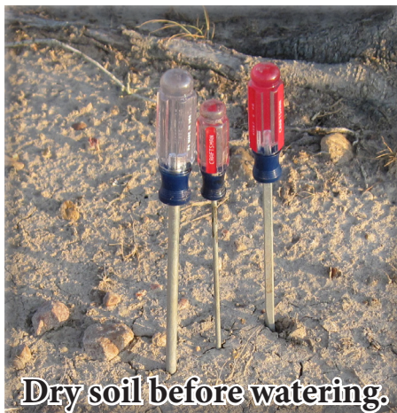
Dry soil before watering.