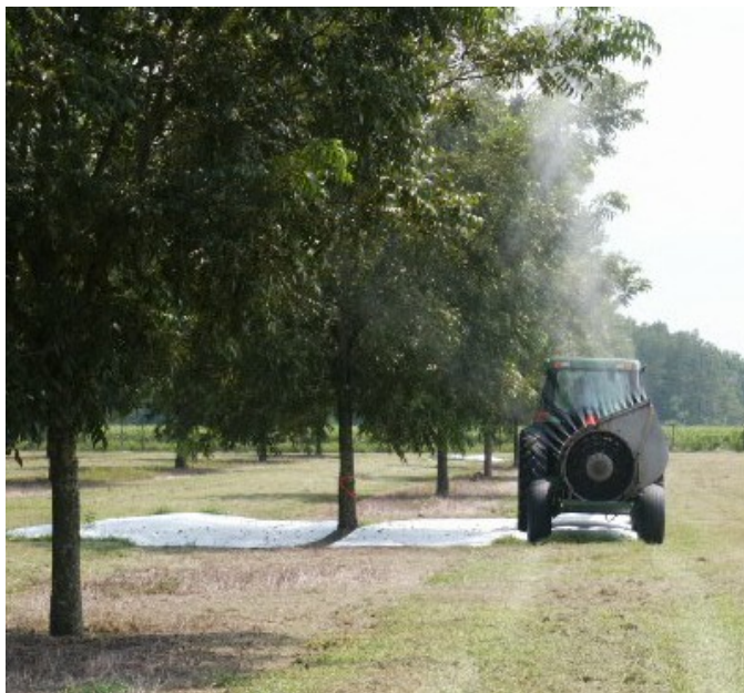
Air-blast type pecan tree sprayer

the spring, and it is unusual, although not unthinkable for the flower crop to be damaged by