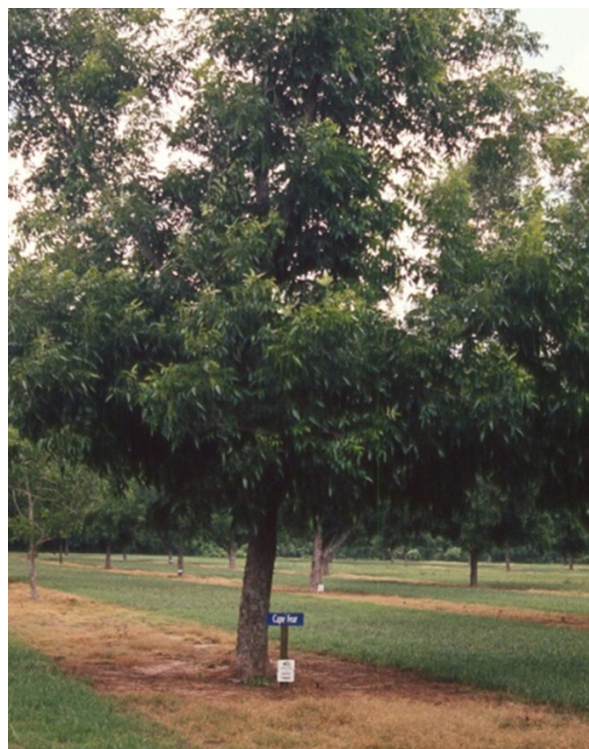
“Sod and Strip” orchard floor

Weeds must be controlled in young and mature pecan orchards to prevent reduced growth