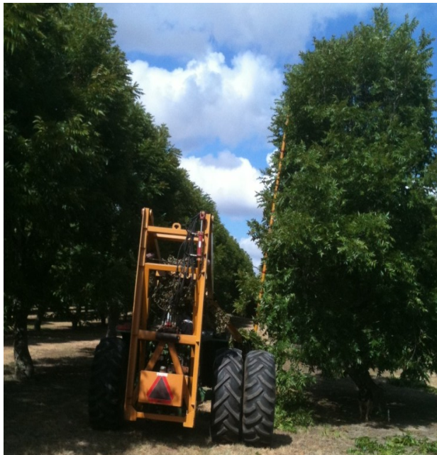
Mature, 30x30 spaced orchard hedged annually to maintain sunlight.

Future tree removal operations should be considered in the designed layout of main varieties, temporary varieties (if any) and pollenizers. Pollenizers should be located so that they will be present in the orchard after trees are strategically removed.