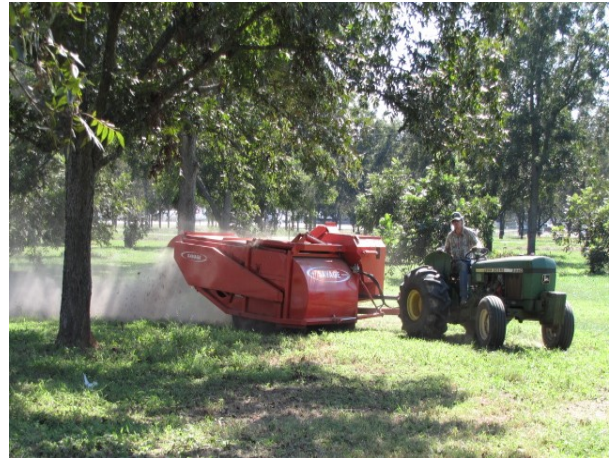
PTO—powered pecan harvester

to prevent kernel darkening, embryo rot, vivipary (sprouting), mycotoxins such as aflatoxin, and other problems related to moist pecans. Shucks not removed in the orchard by nature or the harvesting equipment are removed with dehulling equipment. In south Texas, where harvest is begun before the shucks are fully open to prevent vivipary, the shucks must be ground off in water with special equipment. Once de-shucked, poorly filled pecans are vacuum sepa-