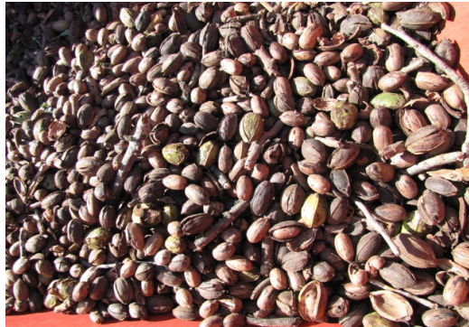
Machine-harvested pecans and trash before processing