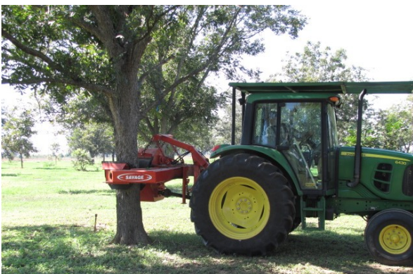
PTO –powered trunk shaker

Processing pecans immediately after harvest is needed to obtain a good early season price and