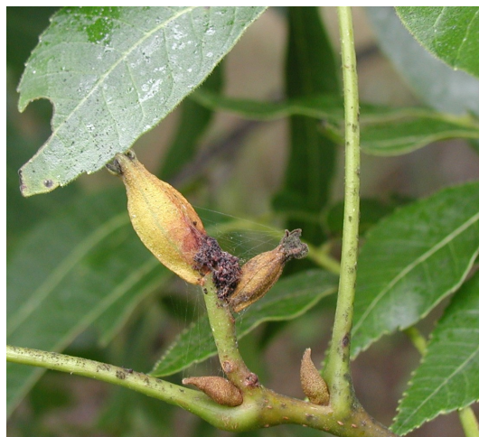
Damage from pecan nut casebearer larvae

todes, Cotton Root Rot, and Crown Gall are potential problems in some regions of Texas.