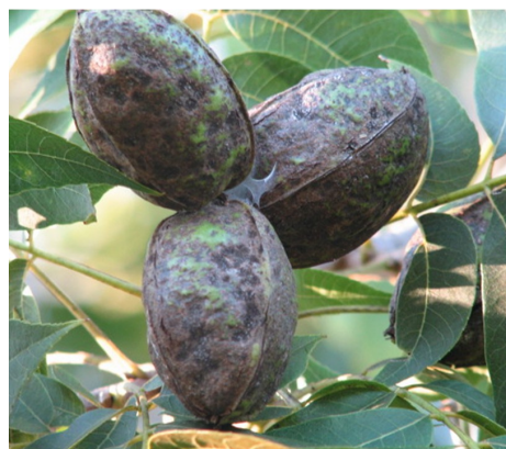
Pecan scab on pecan shuck

prevalent. All growers may encounter Downy Spot, Powdery Mildew, Shuck Dieback, Stem-End Blight, Bacterial Leaf Scorch, among others. Root-knot nema-