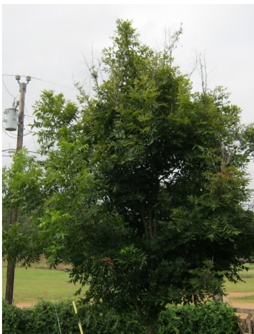
Pecan tree exhibiting severe zinc deficiency ; bunchy canopy , small leaves , & limb dieback

Foliar Zinc Sprays are essential for pecan growth in Texas. Soil or drip system applications of zinc are not effective. Zinc is needed for leaf expansion, so applications should be made frequently in the early portion of the growing season for maximum growth. Two products, zinc sulfate wettable powder or liquid zinc nitrate, are used with equal success. Liquid nitrogen (32% urea ammonium nitrate) can be added to either zinc