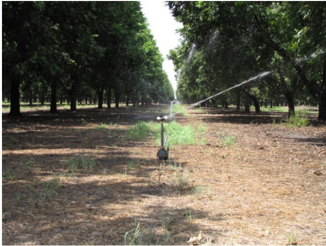
Solid set- type sprinkler irrigation

at least never be allowed to go longer than 21 days without water. Salts in the soil and/or water can significantly reduce growth or kill the trees in extreme cases. Potential pecan orchard sites or problem orchards need to have their irrigation wells tested for water volume, quality, and the cost of electricity for pumping the water. A good rule of thumb is to have a well capacity of 10 gallons of water per minute for each acre of trees.