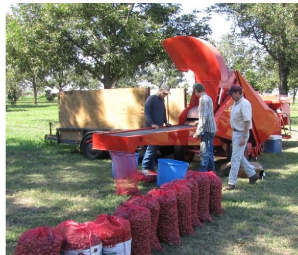
Pecan cleaner and sacking operation