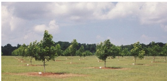
Well spaced young pecan orchard

ing that occurs. Wider spacing (50 x 50; 60 x 60) is recommended for growers who want to extend the time when crowding prevention methods will be needed. Where there is a desire for pecan trees to never crowd, they should be planted 75 to 100 feet apart or further.