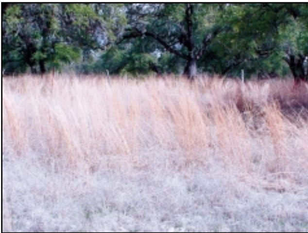
Figure 2. Quail need a minimum of 300 nest clumps per acre.

Each grazing system has a different effect on wildlife and habitat, and no single system can meet all ecological and financial objectives on every type of rangeland. Therefore, grazing systems should be selected according to local conditions and landowner objectives. Specialized grazing systems that strategically define recurring periods of grazing and rest can be used to improve range condition for quail and other wildlife (Fig. 2).