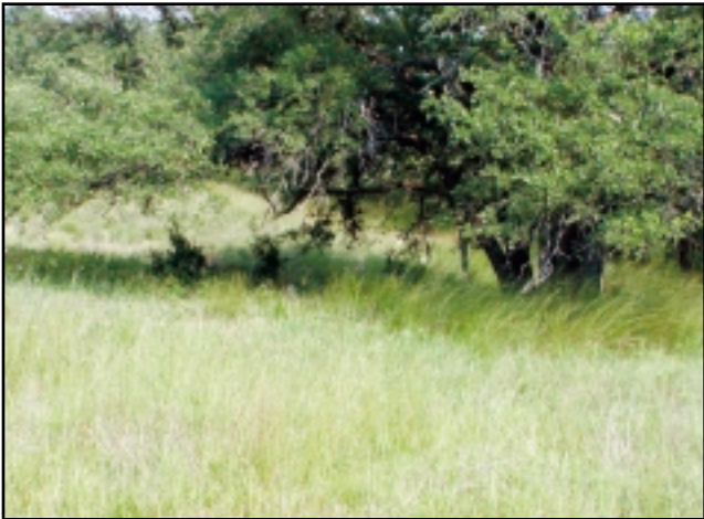
Figure 7. Grass and forb cover 18 to 24 inches tall is needed for excellent white-tailed deer fawning areas.

Like domestic goats, many exotic species are intermediate feeders between cattle (grazers) and white-tailed deer (browsers). They can shift their diets relatively easily from grass to browse or browse to grass (Fig. 6). This flexibility makes them very competitive with white-tailed deer for forbs and browse (Table 2). In addition, exotics may browse 6 feet high or more, which puts remaining browse out of the reach of white-tailed deer because they can browse only to 4 feet. White-tailed deer need grass and forb cover approximately 18 to 24 inches high for fawning areas (Fig. 7). If both exotics and livestock are present, too much grass could be removed to maintain healthy habitat for white-tailed deer and other wildlife.