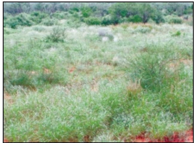
Figure 3. Where brush is sparse, quail must rely more on herbaceous plants for travel and escape cover.

The combination of rainfall and the amount of brush influences the proper grazing intensity for quail. In areas that get 20 to 30 inches of rainfall, grazing should be light on rangelands with 5 percent or less brush cover. In such areas, herbaceous plants must provide more of the travel and escape cover that would otherwise be provided by brush (Fig. 3). However, if brush species are diverse and of mature height, grazing can be increased to moderate levels. Rangelands that receive 30 inches of rainfall or more can be grazed at moderate levels when there is 5 percent or less brush cover.