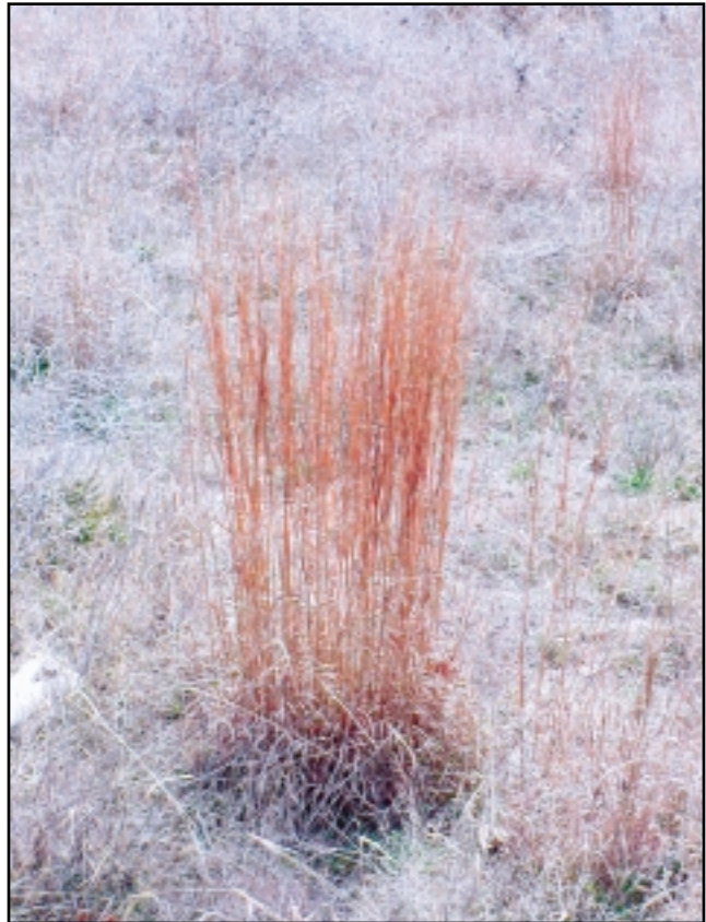
Figure 1. Basketball-sized grass clumps provide excellent quail nesting sites.

good or excellent depending on the status of vegetation relative to its natural potential. The correct range condition for quail depends on location. In areas with deep soils, a long growing season, and high annual rainfall (more than 30 inches), range condition should be fair to good. In areas with poor soils, a short growing season, and low and variable rainfall, range condition should be good to excellent. Grazing can be used to achieve the proper range condition for quail habitat. Where the annual rainfall is less than 20 inches, grazing should be light to benefit quail, especially to preserve adequate nesting habitat (Fig. 1). In areas with more than 40 inches of rainfall and abundant grasses and forbs, continuous grazing can be moderate.