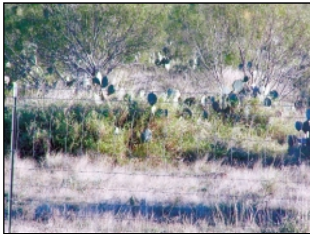
Figure 4. Grass growing among thorny brush or cactus provides good nesting cover for turkeys.

Grazing pressure or intensity appears to influence the nest sites turkey hens select. Hens usually choose ungrazed or lightly grazed areas for nesting. Low-growing, thorny bushes or cactus interwoven with grasses are especially valuable for nesting (Fig. 4). Herbaceous vegetation can become too dense or tall for nesting in areas with more than 30 inches of annual rainfall, so some grazing would improve nesting conditions in those areas.