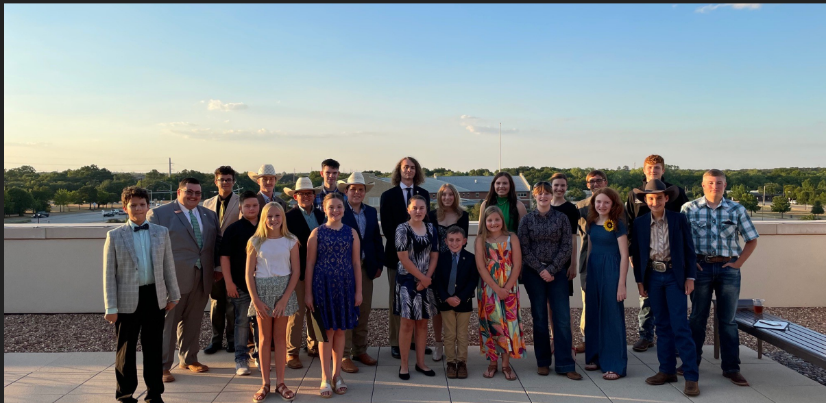
Denton County 4-H Gold Star Awardees