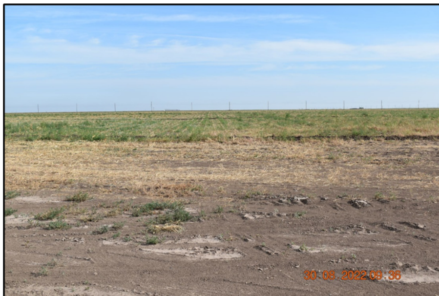
Plate 10. Irrigated corn field harvested for silage in Moore county.