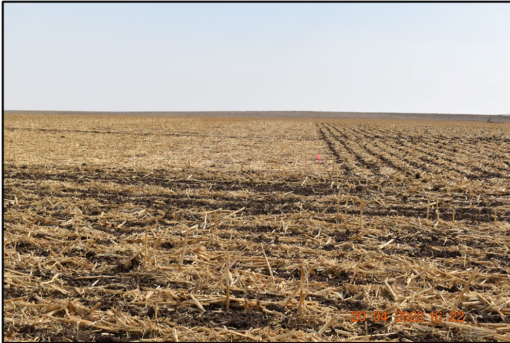
Plate 5. Adjacent no-till (left side) and strip-till (right side) treatments in a pivot irrigated field in Dallam county.