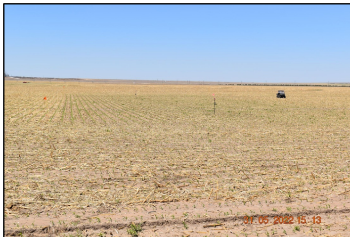
Plate 6. Installed soil moisture sensors within tillage plots of a pivot irrigated field planted to corn in Dallam county.