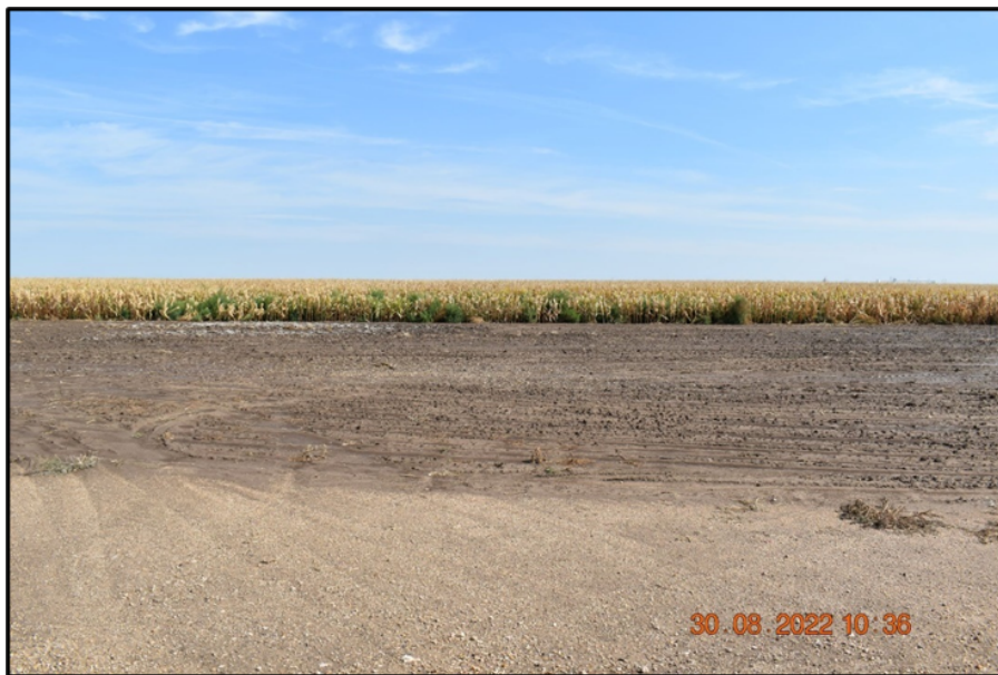
Plate 9. Corn field with irrigation terminated early in Moore county.

In a drought year like what has been underway, irrigation on corn and perhaps, other crops may have to be terminated early due to water shortages. There is simply not enough capacity for wells to keep up. Depending on stage of crop growth it is worthwhile having an alternative plan that can be implemented quickly. Plate 9 below illustrates what appears to be early termination of a corn crop due to a shortage of irrigation water. One option is to harvest the crop biomass, converting it into silage (Plate 10). In these situations, harvest timing is key to ensure a higher tonnage and highest possible quality of silage. I am hearing that there is a growing market demand for forage in the area and effects of drought like we presently have are further elevating that level of demand.