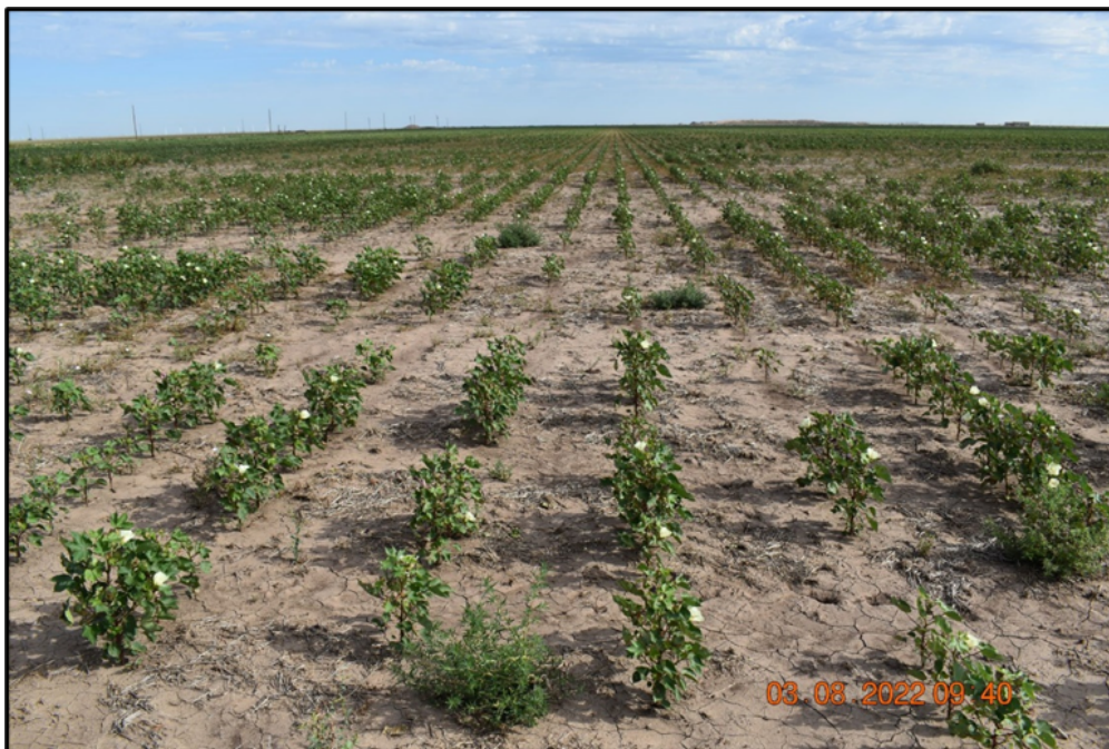
Plate 11. RACE plots within a dryland field planted to cotton in Moore county.

( https://agrilifetoday.tamu.edu/2020/02/24/cotton-key-player-in-water-conservation-in-northern-high-plains/ ). The variety maturity class of cotton planted is an important consideration for timing of crop water needs and total amount of water required for the season.