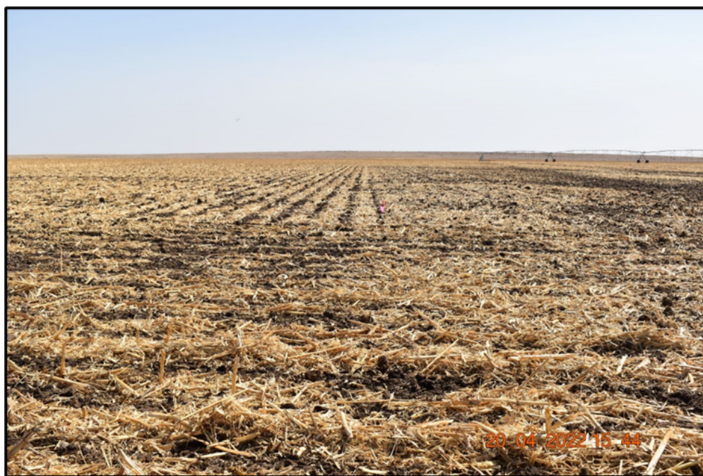
Plate 4. Adjacent strip- (left side) and conventional-till (right side) treatments in a pivot irrigated field in Dallam county.

Management practices have been identified that promote greater stability of nutrient cycling, increase the infiltration of water, improve water holding capacity of soils, reduce the detrimental effects of erosion, and ultimately improve crop yields over time. Long term, these types of beneficial functions become integral to the sustainability of agricultural production in the northwest Texas Panhandle. With that in mind, an idea spurred discussion in the fall of 2021 followed by a considerable amount of planning and progressed with efforts on-farm to implement a replicated, applied, research study in spring of 2022. Main objective of the new study was to compare in-season agronomics, production outcomes, and economic aspects of three tillage treatments supporting pivot irrigated, continuous corn production. Treatments were established in late April which included conventional versus strip-tillage (Plate 4) and no-till versus strip-till (Plate 5). The field and study area was planted on May 12th to corn hybrid Pioneer 1828. Row spacing is 30 inches and dimension of individual plots is 48 rows across and 150 feet long. Rows of all plots were oriented in a north-south direction.