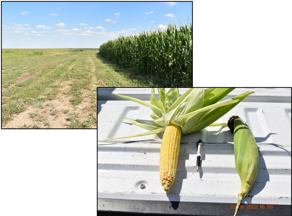
Plates 7 & 8. Edge of pivot irrigated field and milk stage ear corn from field hosting tillage study in Dallam county.

While we are interested in the agronomic efficiency of these tillage treatment comparisons, perhaps more importantly we want to find out about the economic efficiency. Our aim is to assess how dollars spent on input costs stack against dollars for grain when we compare these three tillage treatments.