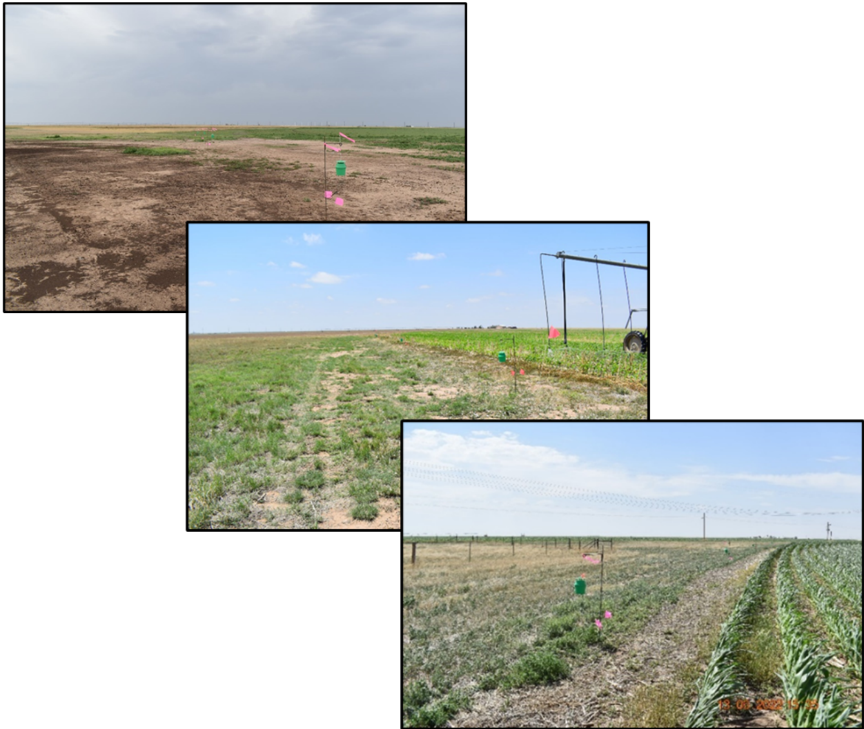
Plates 1, 2 & 3. Adult moth trapping sites for corn in southern Moore, southern Sherman and northwestern Sherman counties, upper left to lower right respectively.

Data has been reported from 11 weekly moth counts starting mid-June of the current corn growing season. This information helps growers, consultants, and others to keep abreast of moth flights, egg lay potential and likelihood of reaching economic thresholds of worm pressure from four, tracked species. These include the Western Bean Cutworm, Southwestern Corn Borer, Corn Ear Worm and Fall Army Worm. 16 bucket traps were installed and monitored in 2022 at two locations in Moore county and two locations in Sherman county (Plates 1, 2 & 3). Based on acres of corn planted in Moore and Sherman counties, these efforts represent a potential impact value of near $772,000.