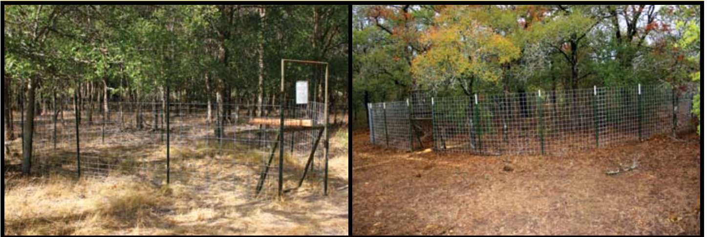
Figure 7. Two different sized corral traps secured with T-posts. Notice both traps are located in wooded areas, providing both concealment and shade.

Once the trap is in the desired shape and location, use T-posts to anchor the trap (Fig. 7). T-posts should be spaced approximately 4' apart. Feral hogs are extremely strong and will test the trap when captured. Do not assume that the trap can be overbuilt. A captured hog can do serious damage to even the sturdiest of traps, and those made of weaker materials may allow hogs to escape altogether. Always make traps as strong as possible.