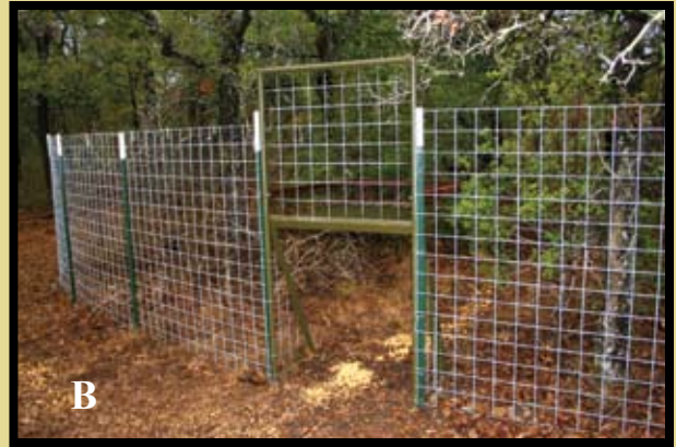
Figure 8. Saloon-type doors require springs for closure (A). Lifting doors can be set in an open position, and once triggered, additional hogs can push their way inside the trap. This model is a lifting gate modified to act as a drop gate on initial capture. After triggering, the gate will close but permit additional hogs to enter (B).

For large corral traps, the trigger should be placed at the back of the trap, away from the door. This allows many hogs to enter the trap prior to door closure. Most trap triggers are made with wire. Some individuals use picture framing wire, as it is durable enough to spring the trap but will break if a hog becomes entangled. The wire is attached to a two-by-four or other prop mechanism on the trap door and is run to the back of the trap, where bait is placed in a hole or scattered on the ground (Fig. 9). T-posts or trees, are used to support the wire from the trap door to the back of the trap. Construct wire eyelets and attach them to the T-posts or trees. As hogs root for the for bait, the wire is stretched and the prop is pulled out, triggering door closure.