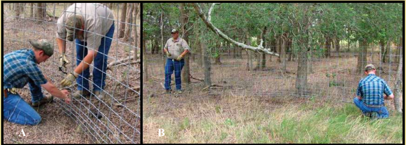
Figure 6. An extra pair of hands is helpful when attaching panels. One person holds the panels in place while the other secures them (A). After all panels are secured, the panels are pulled to their desired location (B).

Once the trap is in the desired shape and location, use T-posts to anchor the trap (Fig. 7). T-posts should be spaced approximately 4' apart. Feral hogs are extremely strong and will test the trap when captured. Do not assume that the trap can be overbuilt. A captured hog can do serious damage to even the sturdiest of traps, and those made of weaker materials may allow hogs to escape altogether. Always make traps as strong as possible.