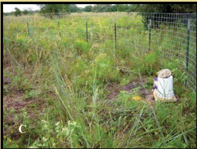
Figure 9. A board is used as a prop on a saloon type door (A). T-posts guide the wire from the prop to the back of the trap (B). The wire is then attached to another wire at the trigger (C). As hogs feed on the bait, the wire is stretched, and the prop pulls from the door.