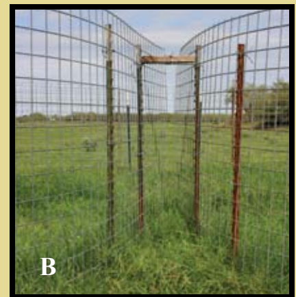
Figure 3. Heart-shaped or Wexford trap. The number of T-posts used depends on trap size and configuration (A). As hogs gather in the chute, they will push their way inside the trap (B).