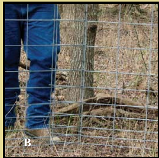
Figure 5. Panel secured to a head gate T-post with doubled wire (A). Remaining panels are attached to one another. It is very important to overlap the ends of the panels (B).

For most corral traps, it is easier to attach all of the panels to one another prior to driving the T-posts. Once all panels are in place and secured, the trap can be shaped by pulling the panels to their desired location (Fig. 6). If the trap is in a wooded area, trees are often used for support.