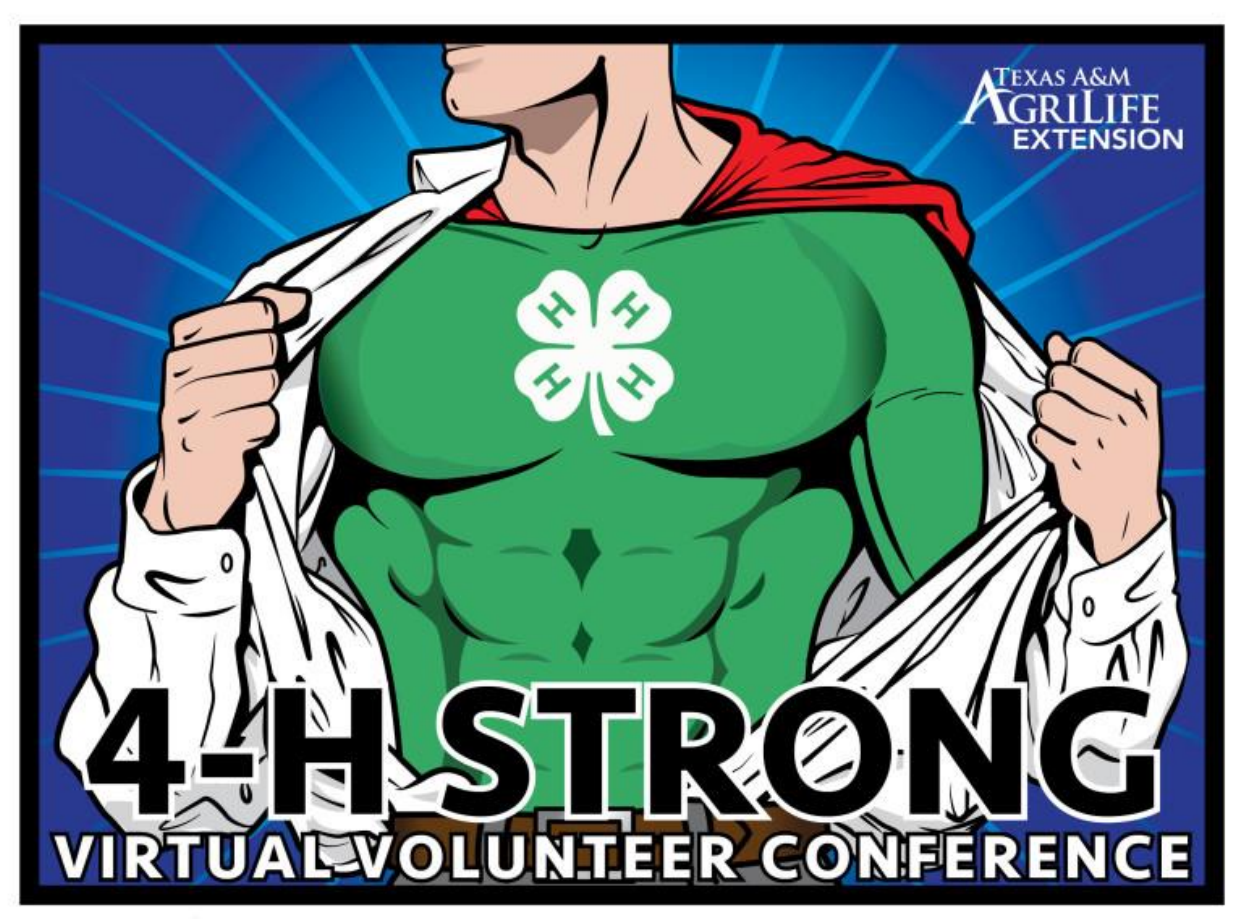
Join Texas 4-H on APRIL 21 & 22, 2015 for a new series of 4-H Strong Virtual Volunteer Workshops. Each workshop is designed to get you pumped up to make the best better for the youth of Texas. Workshops will be conducted via WebEx. See schedule below!