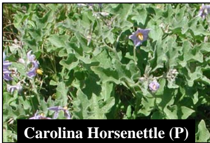
Carolina Horsenettle (P)