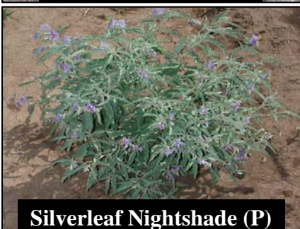
Silverleaf Nightshade (P)