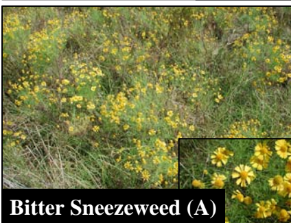
Bitter Sneezeweed (A)