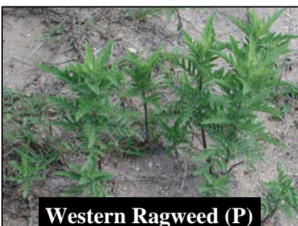
Western Ragweed (P)