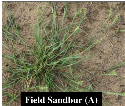
Field Sandbur (A)