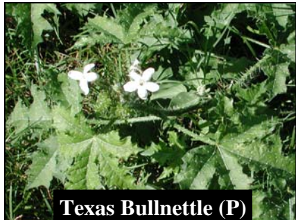
Texas Bullnettle (P)