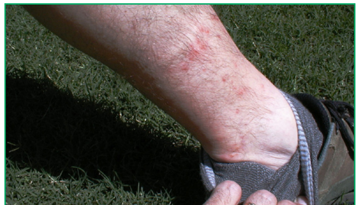
Chigger bites are most common on the lower parts of the body in areas of tight-fitting clothing, such as under socks.

Contrary to common belief, chiggers do not burrow into a host’s skin or suck blood. They pierce the skin with their sharp mouthparts and inject a digestive enzyme, disintegrating skin cells for food. Itching usually begins within 3 to 6 hours after an initial bite, followed by development of reddish areas and sometimes clear pustules or bumps. As the skin becomes red and swollen, it may completely envelop the feeding