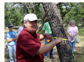
Measure the diameter inches of each tree to be treated.

To determine the amount of fungicide to order, you will need to take a measurement of the trees to be treated. To calculate the number of diameter inches (DBH), measure the circumference of the tree at breast height and divide by 3.14 or \pi . Trees within the 75ft radius will need 20 ml of fungicide per diameter inch of tree, per liter of water.