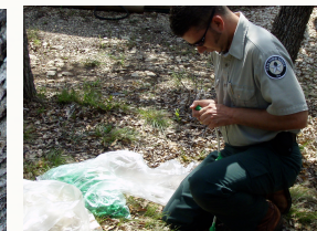
Assemble tubing and T-connectors in the kit.