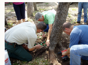
T-connectors are inserted as holes are drilled into the root flares.