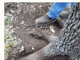
Dig out the root flares and clear away soil around tree.

One quart of Alamo R will treat 47 diameter inches of tree.