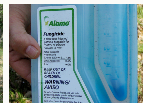
Order the macro-infusion kit and the fungicide.