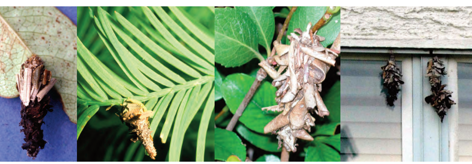
Fig. 7. Bagworms on Indian hawthorn