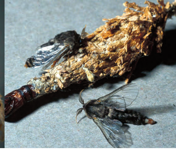
Fig. 3. Male bagworm moths around bag in which male pupal skin emerged

The live oak bagworm ( O. abbotii ) is abundant in the south-central part of the state, along the Gulf Coast to the Louisiana state line. Caterpillars can be found throughout the spring and summer. Most of the moths emerge in April and May, but some appear through October. Larvae may hibernate during the winter and resume feeding in the spring before pupation. Hibernated eggs may hatch as early as February.