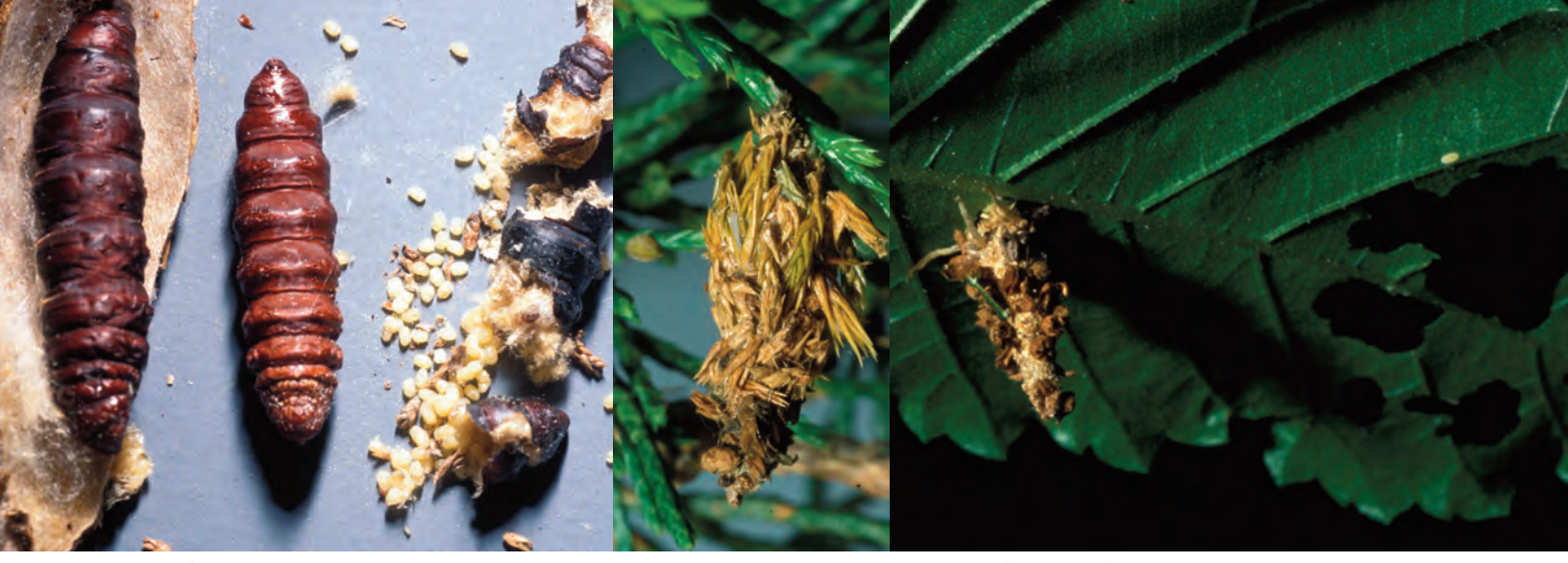
Fig. 4. Bagworm female pupal skin containing eggs in winter