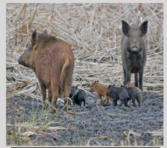
Feral hog sounder