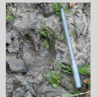
Feral hog track