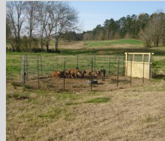
Corral trap with feral hogs