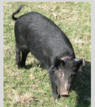
Feral hog fitted with a tracking