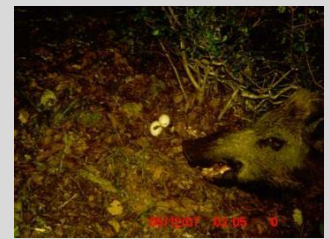
Feral Hog Consuming Rio Grande Wild Turkey Nest