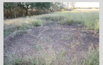
Feral hog rooting damage