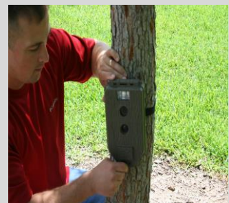
Trail camera installation