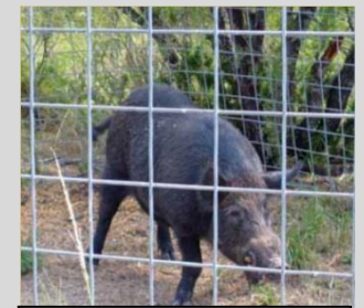
Feral hog in a corral trap