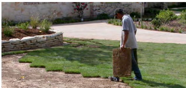
Figure 4. Sod installation

To reduce the need for short pieces when installing sod, it is generally best to establish a straight line lengthwise through the lawn area. The sod can then be laid on either side of the line with the ends staggered as when laying bricks. A sharpened concrete trowel is very handy for cutting pieces, forcing the sod tight and leveling small depressions. Immediately after the sod is laid, it should be rolled and kept moist until the sod is well-rooted into the soil. Newly transplanted sod should be watered immediately to wet the soil below to a 3-inch depth to enhance rooting. During the 2 to 3 week following transplanting, sod should be watered daily to maintain this soil moisture.