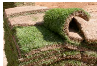
Figure 2. Sod pieces stacked on a pallet awaiting installation

Before ordering or obtaining the sod be sure you are prepared to install it and have adequate irrigation capability. Sod is perishable; it should not remain on the pallet or stack longer than 36 hours (less in hot weather).