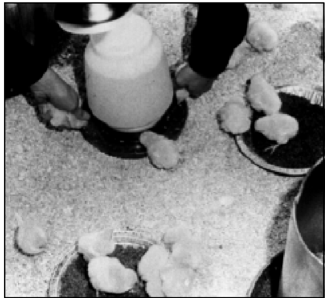
Water, feed and a heat source are all essential in getting broiler chicks off to a good start.

After the broilers are four weeks old and fully feathered, heat is seldom required. Some exhibitors tend to keep their birds much too warm. This will affect feathering, flock uniformity, fleshing and finish.