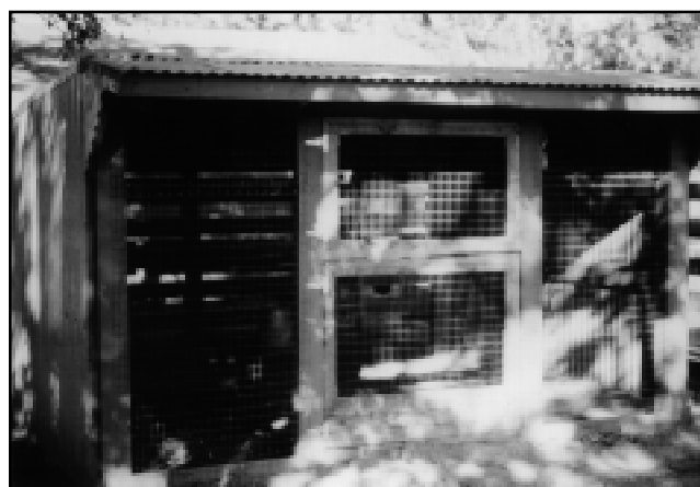
A typical building used for growing broilers for a youth project.

sides during brooding and in cold weather. Make certain the concrete or dirt floor is at least 6 inches above ground level to prevent flooding. The roof overhang should be sufficient to effectively protect against blowing rain.