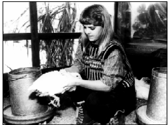
Handle broilers carefully. Keep feeders and waterers level with the back height of the broilers.

Broilers respond to attention. Walk among broilers and stir feed three to five times per day. This will provide exercise and increase feed consumption and growth.