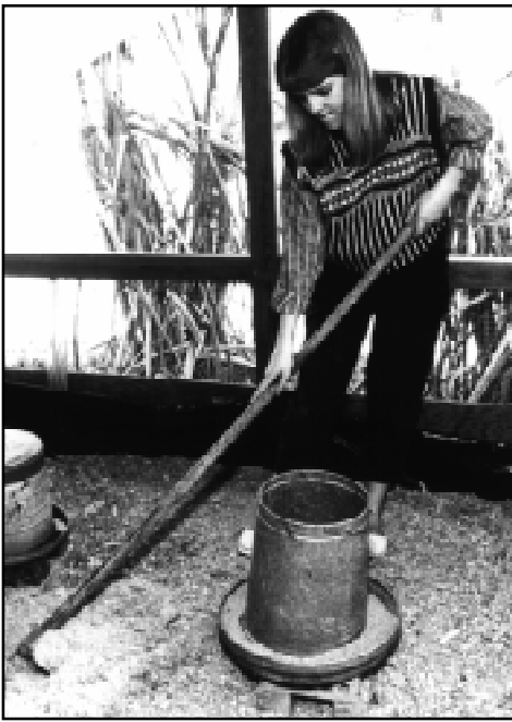
Stir the litter daily to prevent packing. Damp or caked litter will cause health problems and affect broiler performance.

Small amounts of broiler feed moistened with milk and cooking oil and fed several times during the day will stimulate older birds to eat more and increase growth. This supplemental feeding practice can be particularly helpful in hot weather with broilers over four weeks of age. Caution: Do not put out more moistened feed than the broilers can eat in 10 to 15 minutes. Do not moisten the feed until feeding time. Be certain all birds can eat at the same time. Feed any leftover moist feed to the culled birds.