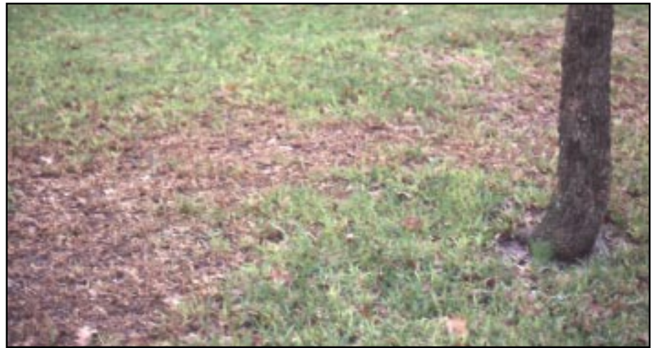
Severe take-all root rot (patch) symptoms on St. Augustinegrass showing leaf yellowing, rotting stolons and bare ground.

Take-all root rot may be mistaken for Rhizoctonia brown patch, white grub damage or chinch bug injury on St. Augustinegrass. If you suspect your turfgrass has take-all root rot, first eliminate the possibility of white grub or chinch bug infestation by examining it. To check for white grubs, cut three sides of a 12- x 12-inch section of sod to a depth of 4 to 6 inches with a shovel or spade. Fold the sod back like a flap and record the number of white grubs present. Return the