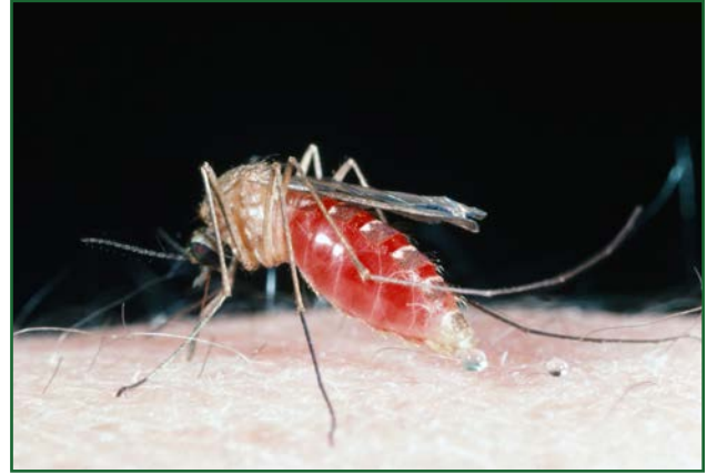
Figure 5. Mosquito adult.

Mating usually occurs quickly in the air near the emergence site. All of the eggs can be fertilized after a single mating because the females can store the sperm internally. Male mosquitoes usually die soon after mating.