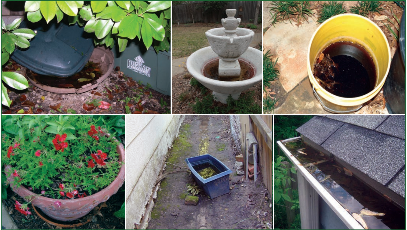
Figure 6. Artificial containers that can serve as mosquito egg-laying sites: (from top left) a garbage can lid, birdbath, plastic bucket of water, flowerpot, plastic container, and a clogged rain gutter.

winds for 20 to 40 miles or more away from the larval development sites.