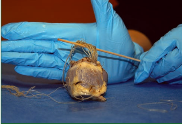
Figure 8. Dog heart infected with dog heartworms.

D. immitis is normally transmitted from dog to mosquito to dog. We do not know definitely what the mosquito vectors of dog heartworms are in Texas, but several mosquito species are suspected from the genera Culex , Aedes , and Anopheles .