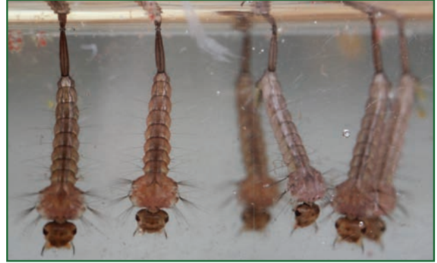
Figure 3. Mosquito larvae.

Wigglers live only in water and feed on microscopic plants, animals, and organic debris