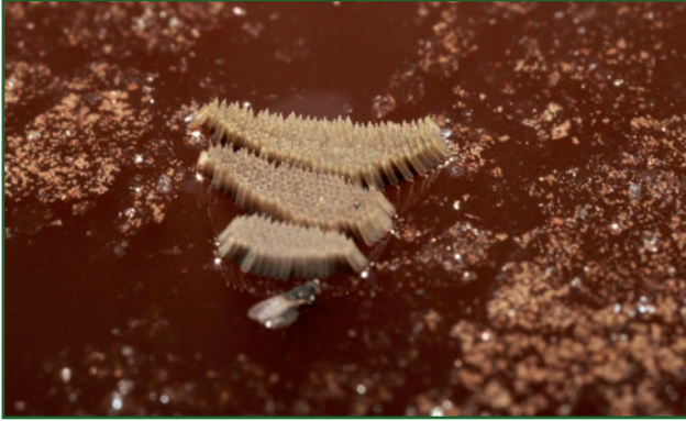
Figure 2. Mosquito eggs.

adult stage can fly and lives on land; the other stages are aquatic.