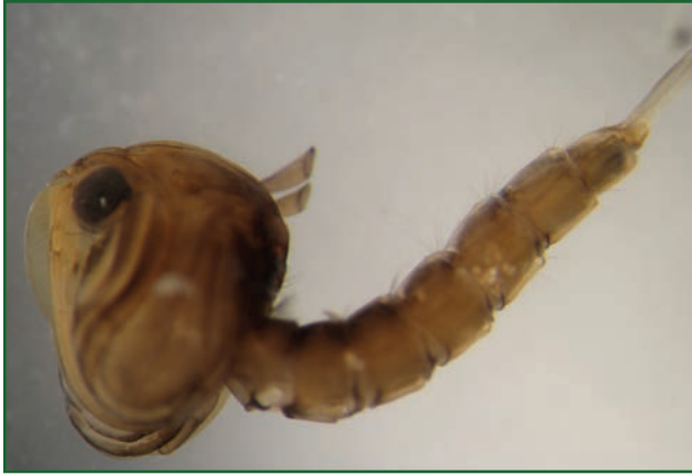
Figure 4. Mosquito pupa.

enlarged, consisting of a fused head and thorax (Fig. 4). A pair of breathing tubes, or trumpets, extends from the back of the thorax. The pupal abdomen or tail consists of several segments that move freely.