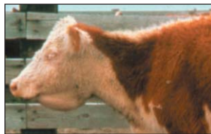
A cow with bottle-jaw.

Some cattle may become emaciated with “bottle-jaw” (a soft swelling under the jaw) and advance to a “downer” stage, becoming unable to rise. In many cases, the cattle may die.