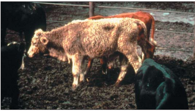
Calves with pneumonia and gastroenteritis are common in fall after a long, hot summer.

When any one of these health problems is recognized in a stressed cow-calf herd, it can be assumed the cattle were carriers that broke with the disease even without a recent exposure to the disease agent. The diseased cattle may have been exposed and become infected several months before the time of stress precipitating the disease in the cattle with clinical symptoms.