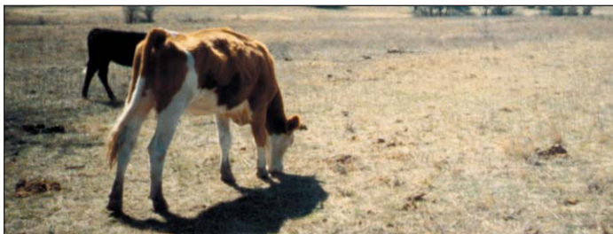
A pulled-down cow is at risk of contracting many types of diseases.

As a cow-calf herd goes into the fall season after a hot, dry summer, the entire herd may be stressed. Excessive heat, short grass and low water tanks stress cattle and make them more susceptible to diseases. Unsanitary conditions and abrupt diet changes also can lead to illness, as can other circumstances of stress. At the end of the summer, the cows are likely pulled down to a thin body condition from nursing the calves, the bulls worn out from breeding, and the calves shocked from weaning.