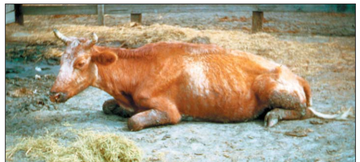
In many cases, cows that advance to the “downer” stage may die.

Many animals go down and cannot rise after 3 to 7 days of clinical signs of acorn poisoning. If these affected animals do not die, it may take as long as 2 to 3 weeks before they start to recover. Producers suspecting such a problem should contact a veterinarian as soon as possible.