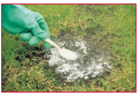
Dry dusts are convenient and easy to apply.

• Acephate (Orthene®) is an effective dry dust treatment that does not require added water. Sprinkle lightly and evenly over the entire mound. Avoid disturbing the colony during application. This can cause the ants to vacate a mound. It's best to keep pets away from treated mounds until the dust is gone. Dust can be easily dispersed with water after the colony is killed.