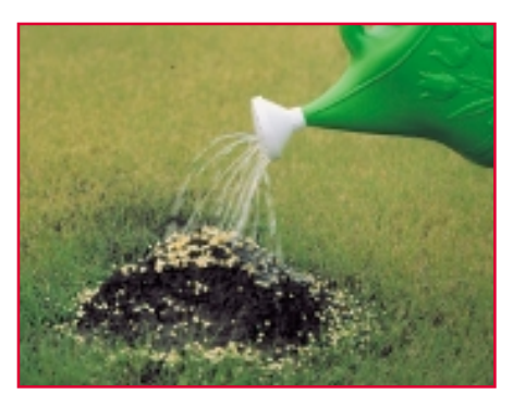
Most granular products contain an insecticide that releases into the soil when drenched with water.

Granular products contain an insecticide that releases into the soil, usually when drenched with water. Sprinkle the recommended amount of product around and on top of the mound. When directed on the label, sprinkle 1 to 2 gallons of water over the granules with a watering can. Sprinkle gently to avoid disturbing the colony and washing the granules off the mound.