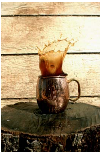
Jalyn Levens Shallowater 4-H

Issue addressed: Agricultural Education and Awareness