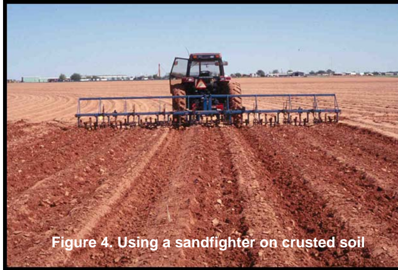
Figure 4. Using a sandfighter on crusted soil

When making replant decisions, the first rule is to not make the final judgment on the extent of crop damage too quickly. Cotton has a tremendous capacity to recover from adversities. Consequently, it is usually best to delay the final stand evaluation until after the crop is exposed to 2 or 3 days of good growing conditions. During this initial period, it is important to protect the crop from further damage by using timely tillage operations. Tillage of crusted fields will minimize wind and sand damage, improve aeration, and hasten warming and drying of the soil that in turn will slow development of seedling disease (Figure 4).