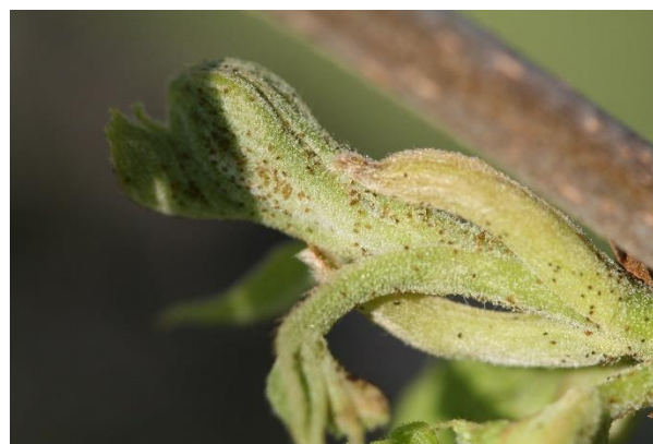
Figure 2. Phylloxera crawlers (dark specks) on new growth.