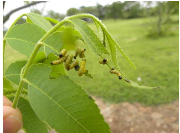
Figure 5. Pecan sawfly Megaxyela major

I generally do not recommend treatment for sawfly but I have seen on an occasion where populations got out of hand. If treatments are needed then there are several brand names of chlorpyrifos or malathion that are recommended.