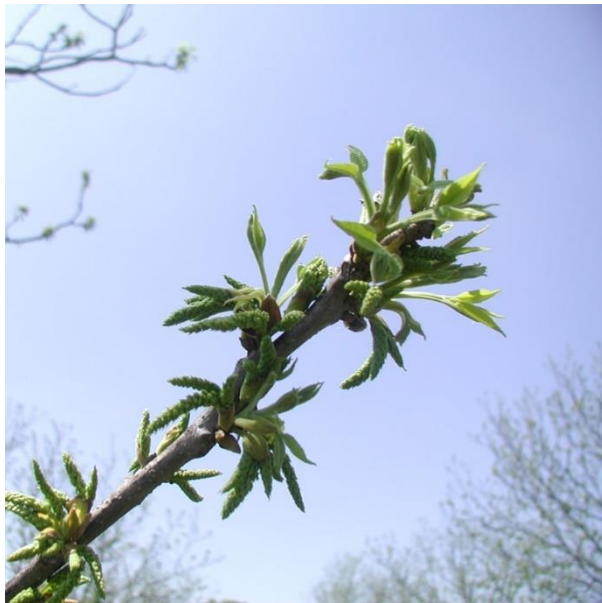
Figure 3. Stage of growth for phylloxera control

For anyone that has had issues with phylloxera, treatment time is at hand for some areas of Texas. I have recommended treatment when new growth is about 1 to 2 inches as shown in the picture below. If you are uncertain about activity, you can see the crawler stage with a 10 X lens as shown in figure 2.