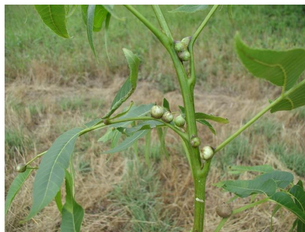
Figure 1 Pecan stem phylloxera , Phylloxera devistatrix , galls