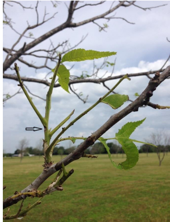
Figure 6. June bug damage

Injury due to June bugs is more critical on young