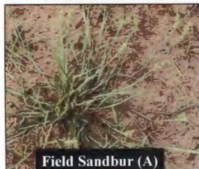
Field Sandbur (A)