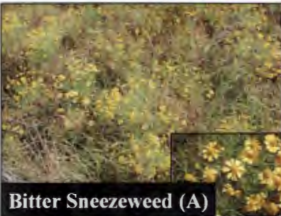
Bitter Sneezeweed (A)