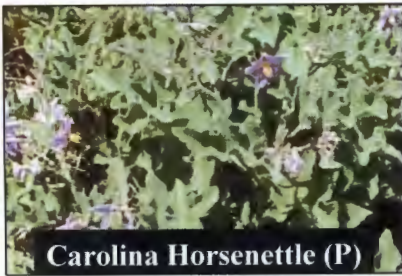
Carolina Horsenettle (P)