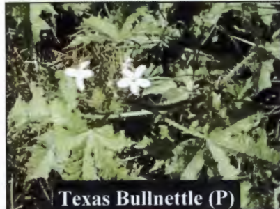
Texas Bullnettle (P)