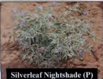
Silverleaf Nightshade (P)