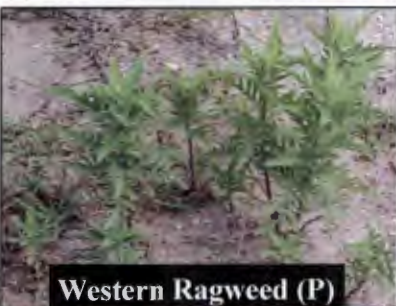
Western Ragweed (P)