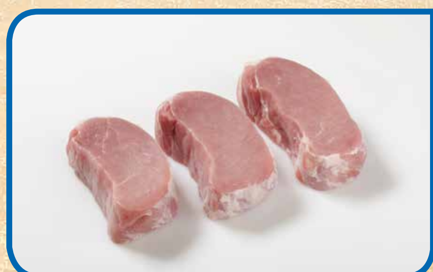
New York Chop