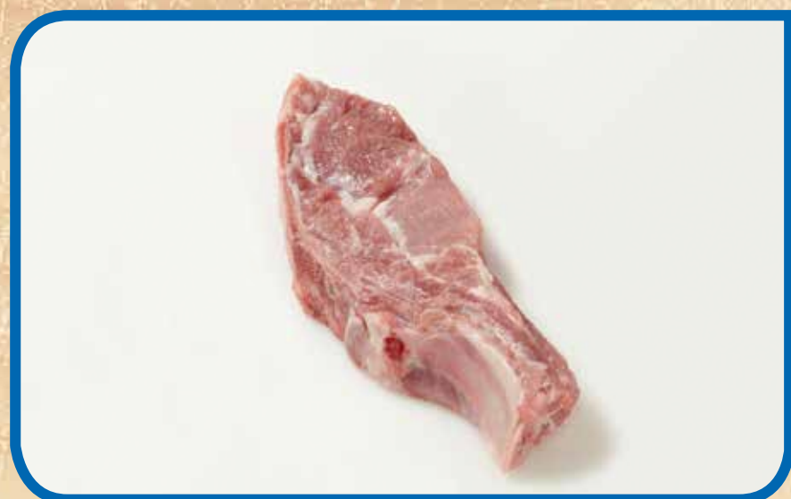
Loin Country-Style Ribs; bone-in