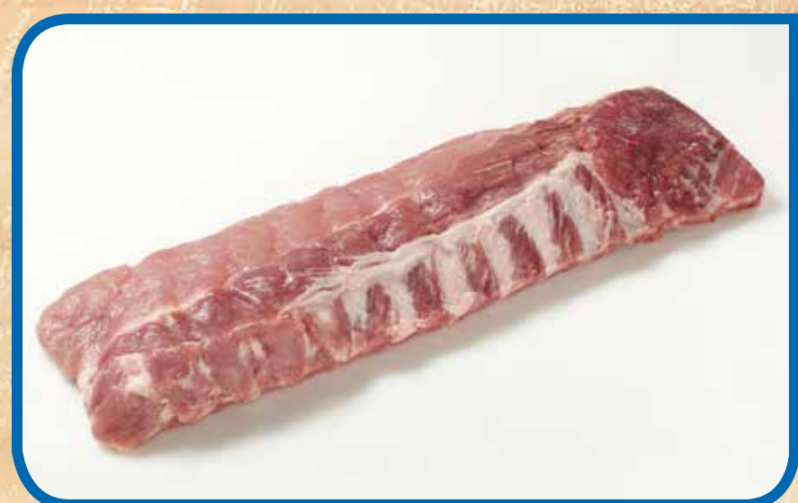
Loin Back Ribs