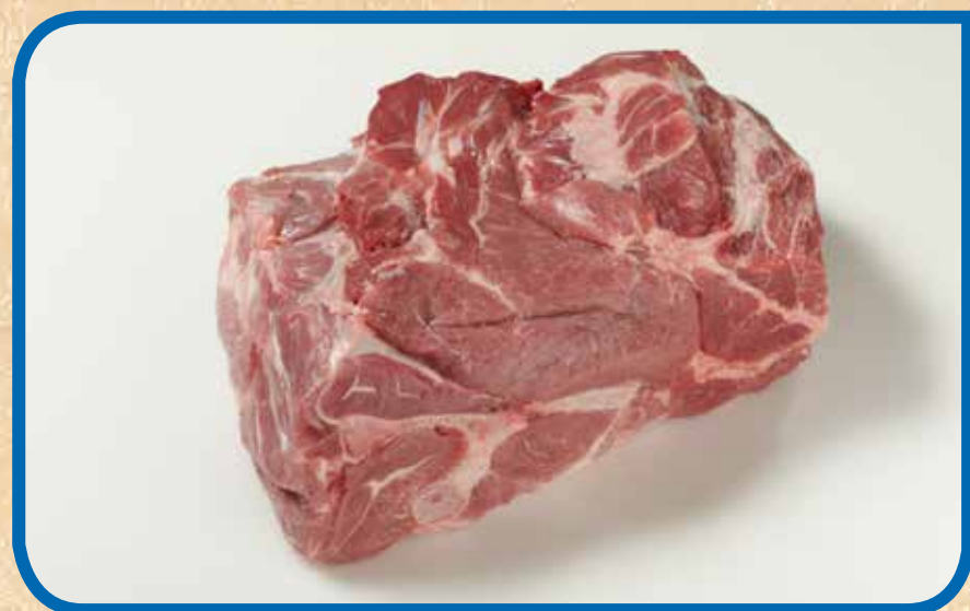
Shoulder Roast; bone-in