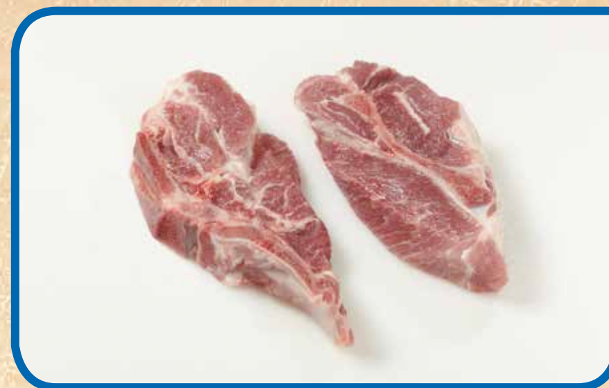
Shoulder Country-Style Ribs; bone-in