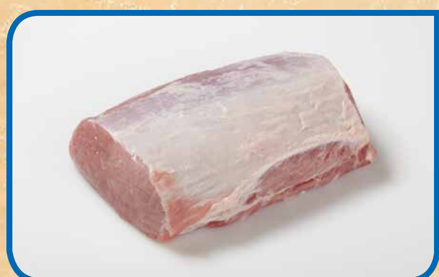
New York Roast