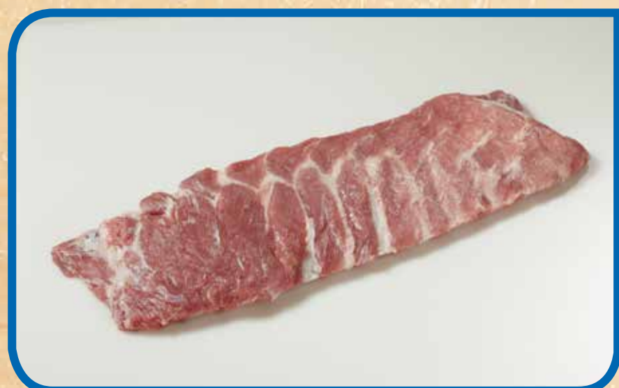
St. Louis-Style Ribs