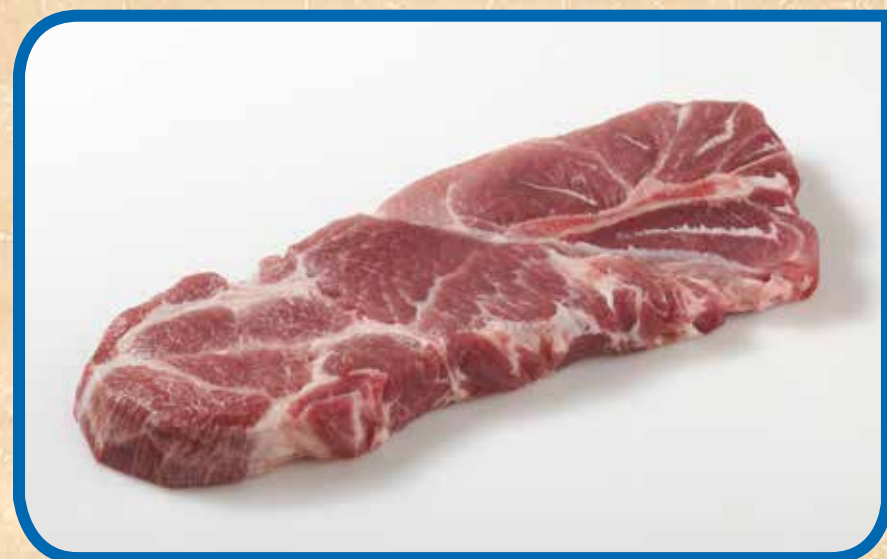
Shoulder Steak; bone-in