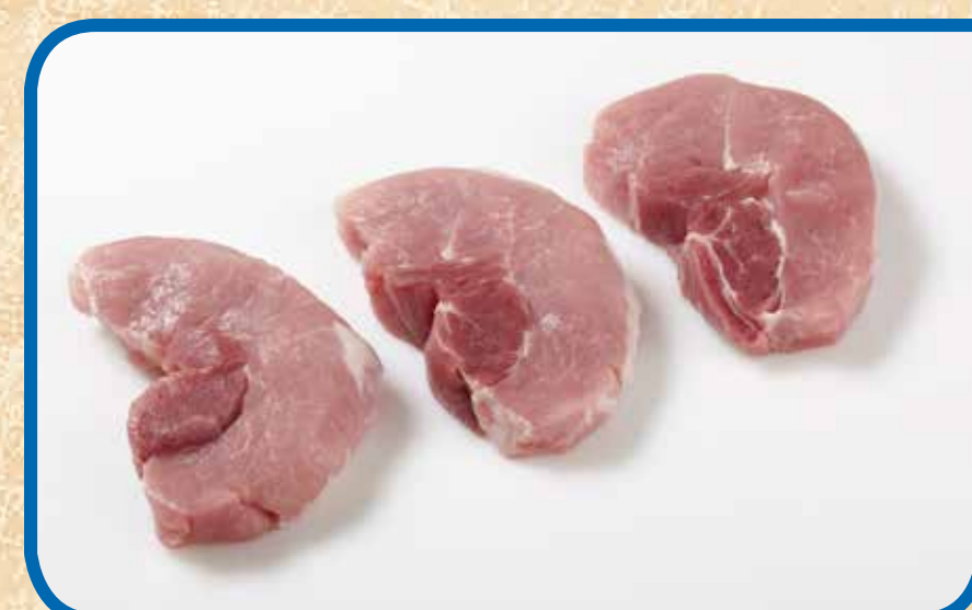
Sirloin Chop; boneless