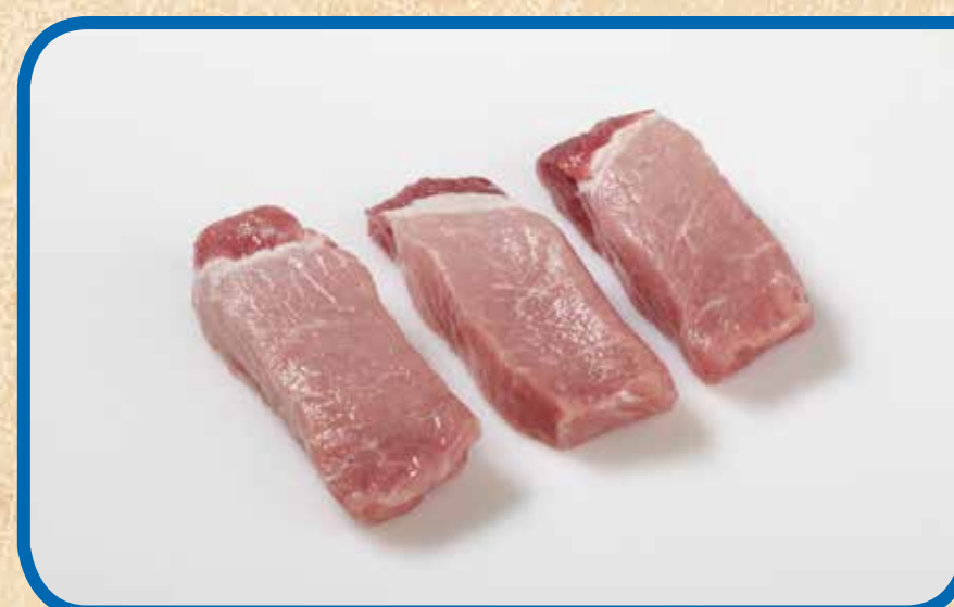
Loin Country Style Ribs; boneless