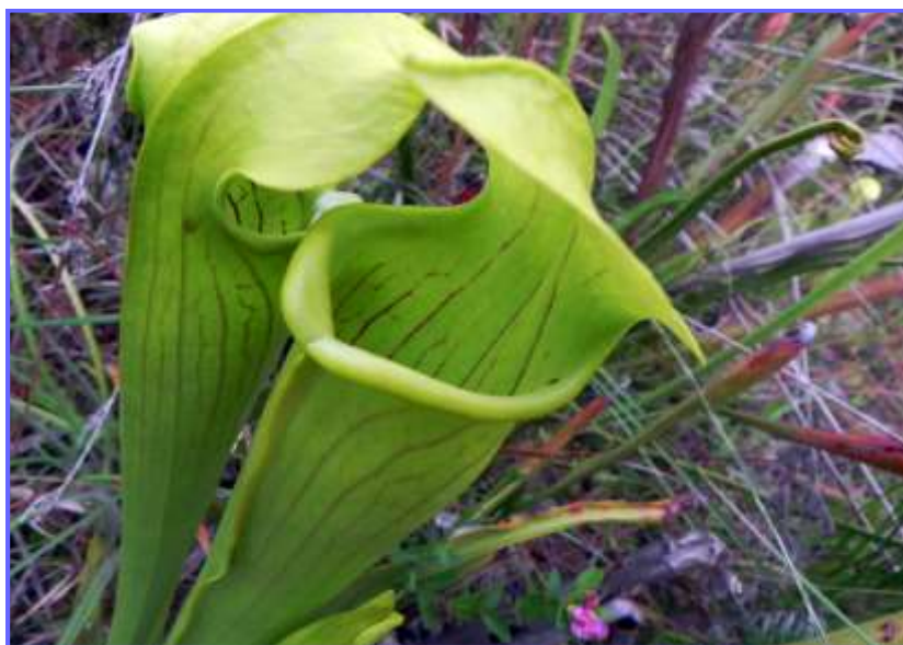
Carnivorous pitcher plants observed near Lake Sam Rayburn on a master naturalist field trip

For more information or to register for the new class, contact the Texas A&M AgriLife extension office at 409 384-3721.