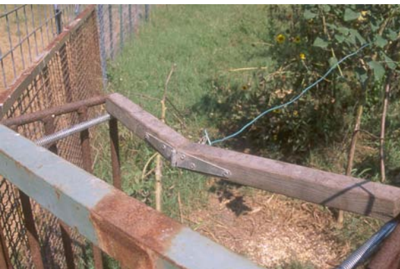
Example 2C. Saloon door trigger mechanism.