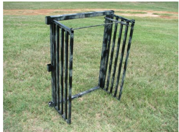
Example 2B. Trap door. Saloon door design.