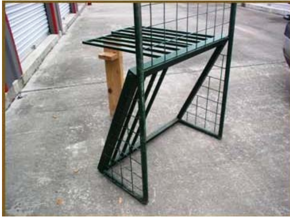
Example 1A. Trap door - Root Gate Design.