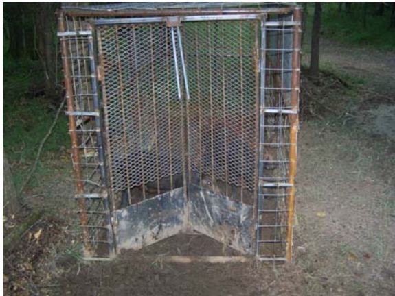
Example 2A. Trap door - Saloon door design.