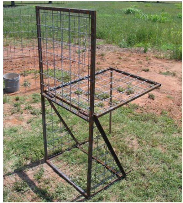
Example 1B. Trap door. Root Gate design.