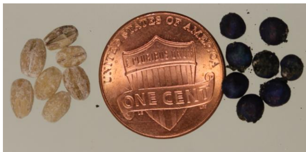
Fig. 1. Initial appearance of Afla-Guard® (left) and AF-36 Prevail™ (right).

AF-36 Prevail™ and Afla-Guard® are commercial preparations of different strains of the fungus, Aspergillus flavus . Neither of these strains produce aflatoxin; thus, they are referred to as “atoxicogenic” strains. AF-36 Prevail™ consists of heat-killed sorghum seed which has been dyed and coated with spores of the fungus (Fig. 1). It is labeled in Texas for aflatoxin control on corn and cotton and is produced by Arizona Cotton Research and Protection Council, with Double CT LLC (Scott Averhoff (972) 616-3228 (scott@doublect.com) or Arleen Averhoff (arlene@doublect.com) as the Texas distributor. Afla-Guard® consists of hulled barley seed coated with spores of the fungus (Fig. 1). It is labeled in Texas for aflatoxin control on corn (field, sweet, and popcorn) and peanuts. It is produced by Syngenta Crop Protection, Inc. and is available from dealers that sell their products.