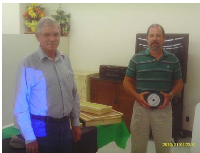
Winners of the donated bee supplies.