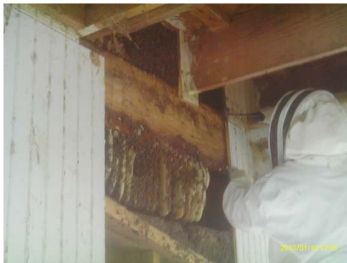
Removing one of the hives in the Bee House