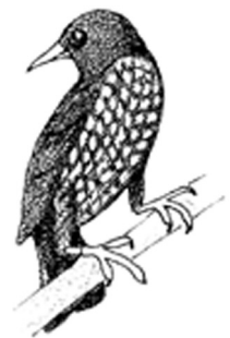
Figure 2. Starling.

Starlings are smaller than grackles (about the size of a robin) and have short, square tails. During the winter adult starlings are speckled with light dots, but they become more iridescent and less speckled during the breeding season. Juvenile starlings are a dusky, gray color.