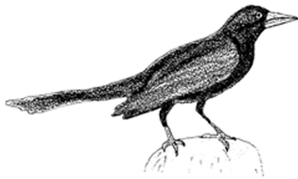
Figure 1. Common Grackle.

These large blackbirds are characterized by long, keel-shaped tails and yellow eyes. Male grackles often appear iridescent purple. They are about the size of a small crow and are very common in Texas. Grackles are frequently seen feeding in fields, lawns, golf courses and orchards. They nest wherever there is adequate cover such as trees in parks, yards, woodlots, orchards and marshes. Grackles are omnivorous, which means they feed on a variety of plant and animal matter. Insects make up the bulk of their diet during the spring and summer