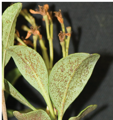
Indian Hawthorne landscape damage.

Plants with the symptoms described above should be examined for the presence of thrips. Leaves or buds from symptomatic plants should be collected and placed into a Ziploc bag to prevent the thrips from escaping. Label the bag with collection locality information, host plant, date collected and name of collector. Samples should be sent next-day delivery to an expert for identification