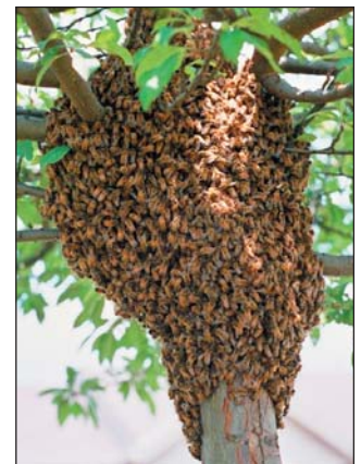
A honey bee swarm.

Because swarms do not have a nest to defend and the bees in the swarm are often full of honey, swarming bees are usually more docile than established colonies and less likely to sting. However, there is always a risk when working around bees. Therefore, Texas Cooperative Extension recommends that you contact a pest control professional to manage a swarm.