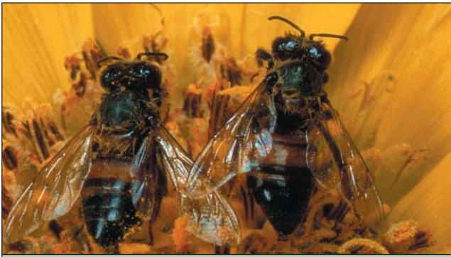
An Africanized honey bee (left) and a European honey bee. Despite size differences in these two individuals, the two strains cannot be distinguished visually.