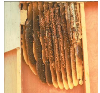
Bees can construct large wax nests rapidly once they enter a home. For this reason, both bees and nests should be removed as soon as possible.

easy to distinguish bees from wasps. Bees are generally hairy, with stout bodies and wide, flattened hind legs for carrying pollen ( see figure ). Wasps are generally smooth or have scattered hairs; they also have distinct “waists.” Another way to tell the two types of insects apart is to find the nest or hive. Honey bee colonies build a wax comb in which to rear their young and store food. Social wasps form nests of paper-like material.