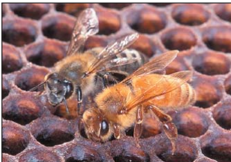
An Africanized honey bee (left) and a European honey bee on a honey comb. Despite color differences in these two individuals, the two strains cannot be distinguished visually.

Once away from the attack, remove the stingers as soon as possible. Stingers should be scraped out with a fingernail, knife or some other sharp object. Stingers continue to inject venom for many minutes after the initial sting. The sooner a stinger is removed, the less venom will be injected. If you