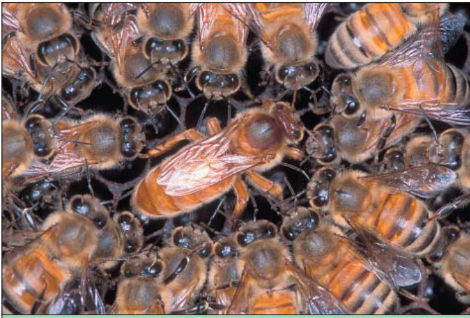
Honey bee workers surround a queen bee. Bees are likely to sting only when they perceive a threat to the nest and queen.