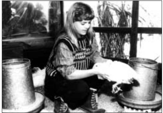
Handle birds carefully. Keep feeders and waterers level with the back height of the birds.

Snub the top beaks of birds if feather picking or cannibalism starts. Trim one-third of the upper beak with an electric beak snubber. Vicks® salve or an anti-peck compound applied to the bloody pecked