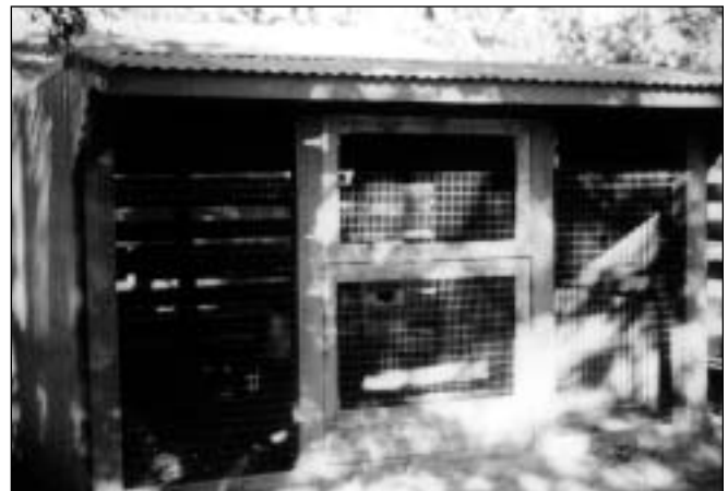
A typical building used for growing broilers or roasters for a youth project.

Be prepared for the chicks 2 days in advance. Put at least 4 inches of litter on the floor of the cleaned, disinfected house. Wood shavings, cane fiber, coarse