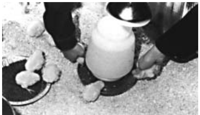
Water, feed and a heat source are all essential in getting chicks off to a good start.

Optimum performance is dependent on proper nutrition. The feed dealer should be informed of the type of feed required at least 2 weeks before chicks arrive so that fresh feed can be ordered. It is absolutely essential that birds receive a high-quality poultry