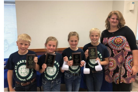
Sibling Saucers and myself after the team won 1st Place at Gillespie County