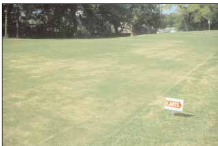
Figure 1. Golf course fairway damaged by white grubs.

White grubs, sometimes referred to as grubworms, injure turf by feeding on roots and other underground plant parts. Damaged areas within lawns lose vigor and turn brown (Figure 1). Severely damaged turf can be lifted by hand or rolled up from the ground like a carpet.