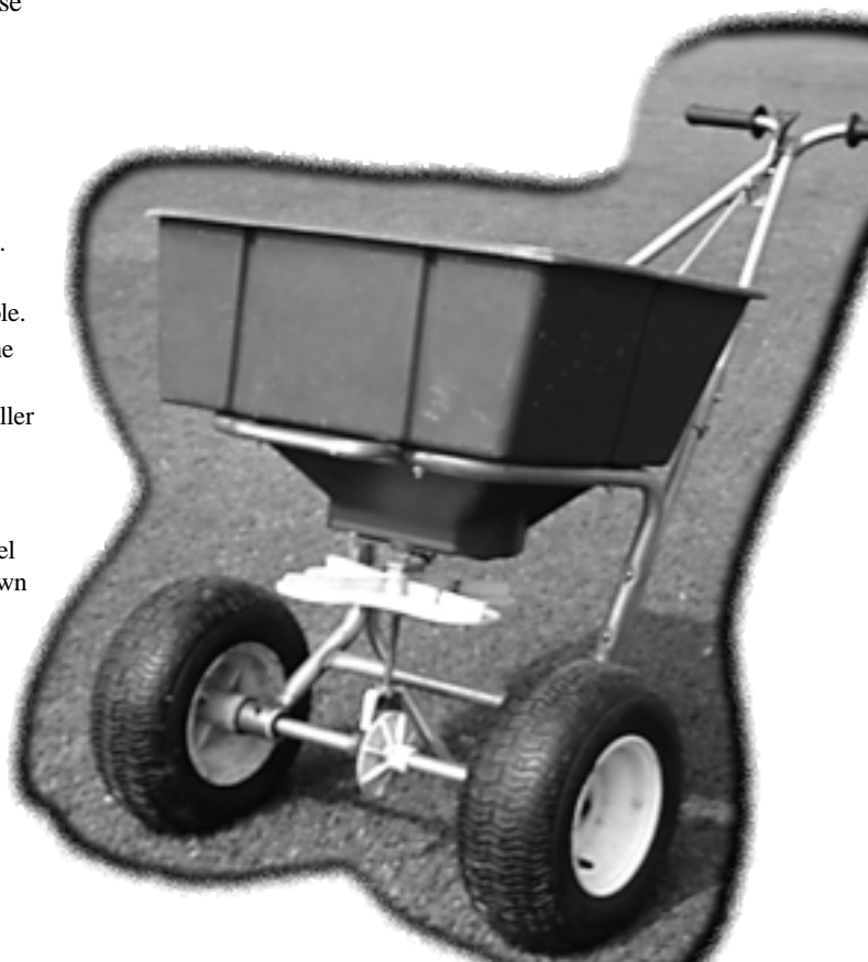
A rotary spreader uses a wide swath for rapid application.

For more information, see the Web site at http://aggjeturf.tamu.edu .