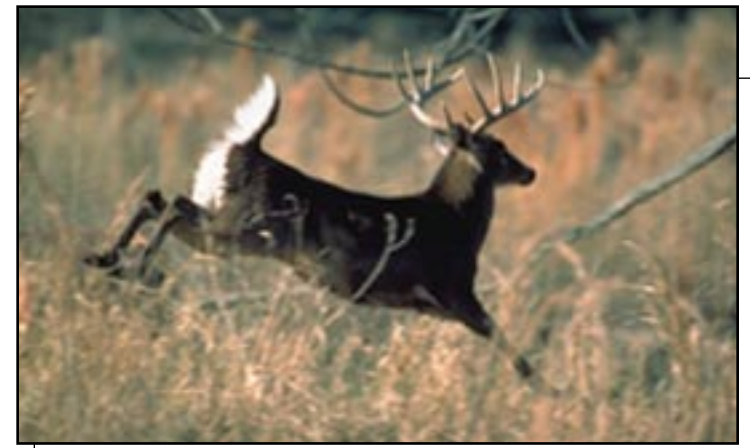
Home range size for white-tailed deer can be from 60 to 800 acres or more.