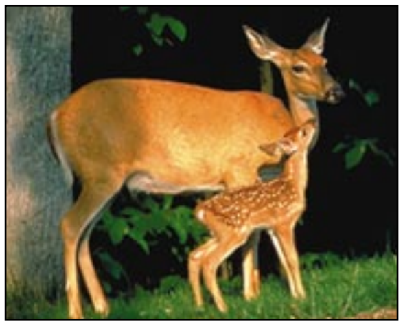
Hiding cover is especially important during fawning season.

The diet of white-tailed deer in Texas is varied and changes with the seasons (Figure 1). They prefer forbs and mast, which are highly seasonal and can vary greatly from one year to