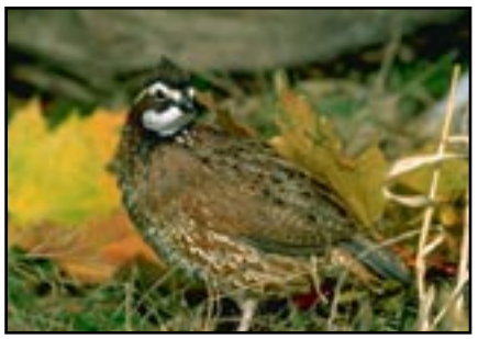
Quail need vegetation less than 6 inches tall for roosting.