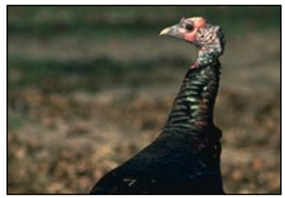
Distribution of turkeys in Texas is controlled mostly by precipitation.

Turkeys do best with more mature stands of brush, whereas quail prefer brush less than 5 years old. Turkeys prefer to nest in rangeland in high condition. Turkey hens need clumps of residual grass about 2 feet in diameter and 1.5 feet tall; quail need 8x12-inch clumps. Nesting turkeys appear to seek ungrazed pastures or those in a grazing system.