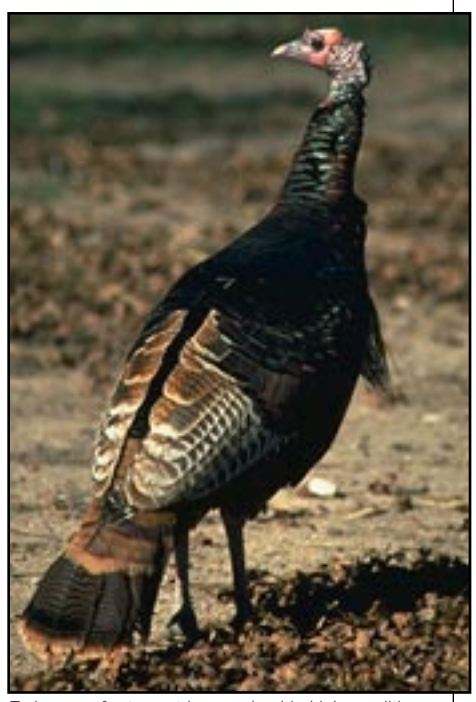
Turkeys prefer to nest in rangeland in high conditions