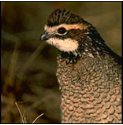
For quail, the habitat must supply many seeds and insects.

Herbicides can be used with caution. Do not use non-selective, broadcast herbicide treatments: They can decrease loafing cover when few brush species are present. However, herbicides applied as individual plant treatments offer great selectivity and flexibility for brush management.