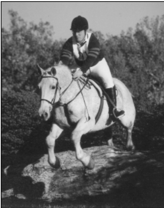
Many performance horses exceed the "light workload" classification and require energy to support a "moderate workload."