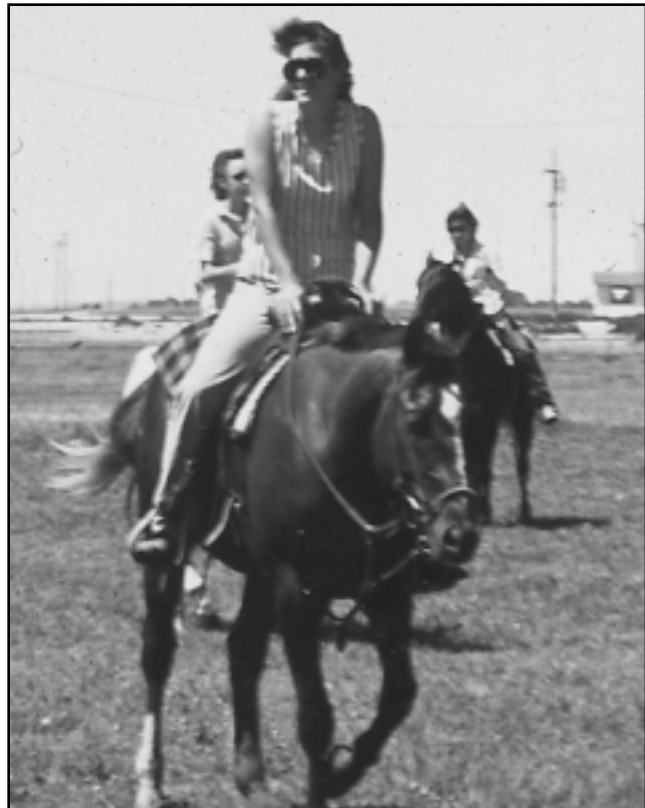
Nutrition influences a horse's body condition, bone strength and available nutrients to perform at various workloads.

For estimates of the energy needs of horses for various levels of work and for different stages of development, see Table 1. Notice also the impor-