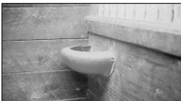
Individual feeding and carefully monitored feeding programs play a major role in maintaining arena performance horses.