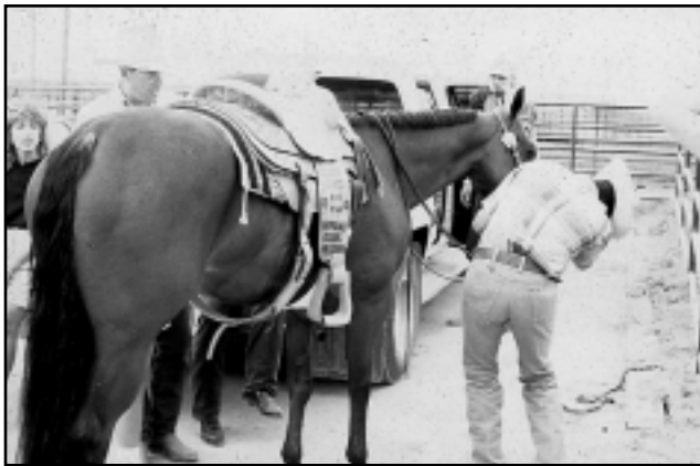
For optimum performance and thermal regulation, performance horses should be neither thin nor fat. They should be in Body Condition Score 5, Moderate Condition.

When trying to meet the nutritional needs of a performance horse, focus on the number of calories it uses for a given amount of exercise. Horses that have not been provided enough calories cannot perform at the same level as those that have enough energy in the diet and stored in the muscles.