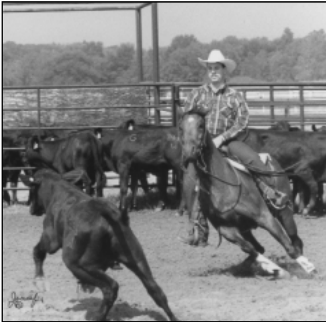
Some performance horses work hard enough to classify the work load as "intense."

High-performance horses , such as cutting horses, reining horses and other athletes, routinely perform both aerobic and anaerobic work while competing in a particular event. Recent research indicates that the performance of such horses can be improved by adding fat to a high-carbohydrate diet . With proper adaptation time, fat supplementation can influence the amount of stored muscle energy in the form of muscle glycogen, which is the fuel supply for anaerobic work.