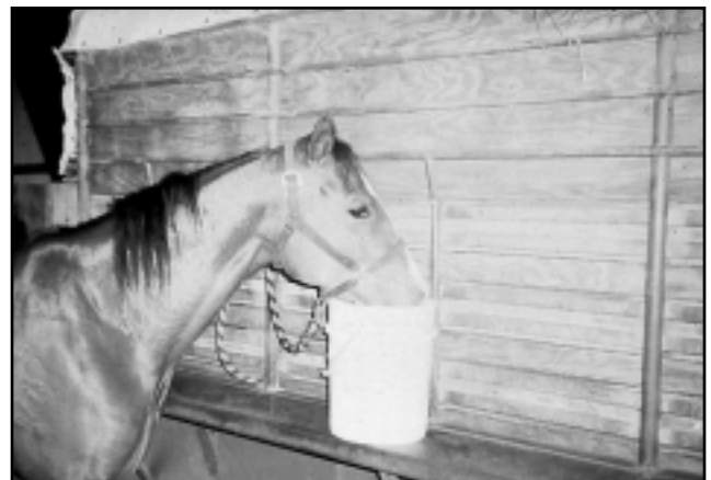
Water is important not only for replacing sweat loss, but also for maintaining blood volume and normal function of the digestive system.