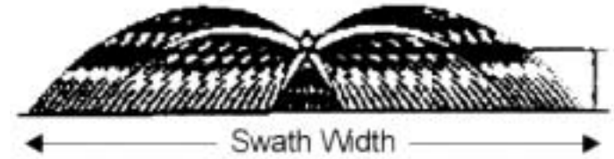
Chart for Nozzle Spacing and Length of Calibration Course