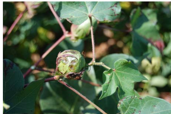
Figure 4. Boll rot symptom associated with Bacterial blight.