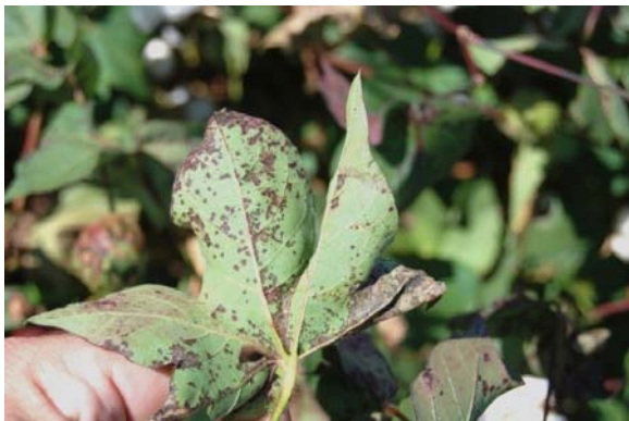
Figure 1. Appearance of angular leaf spot lesions characteristic of Bacterial blight.

During the 2015 growing season, subtle differences in symptom expression have been observed when the disease occurs on varieties that were previously documented as being resistant. While angular lesions occur still occur, the middle portion of the lesion has a distinctly different appearance. Seeming as though the center of the lesion is more degraded and falls out, giving the infected tissue a 'shot hole' appearance (Fig. 5). Furthermore, infected leaves of 'resistant' varieties tend to turn chlorotic more readily (Fig. 6).