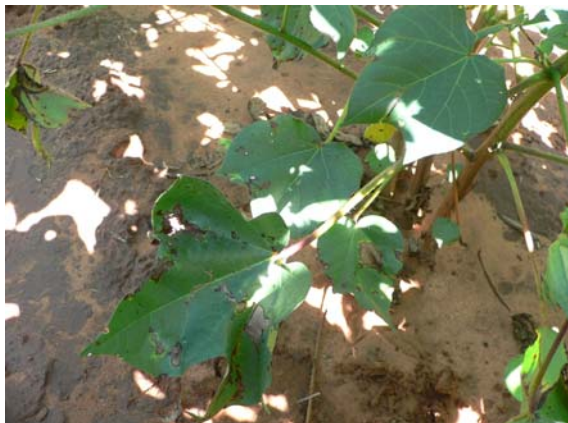
Figure 5. Falling out of leaf tissue associated with Bacterial blight.