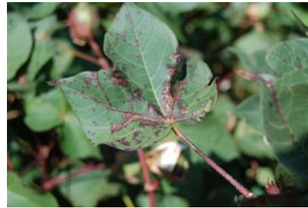
Figure 2. Vein necrosis (top) and leaf necrosis (bottom) associated with Bacterial blight.