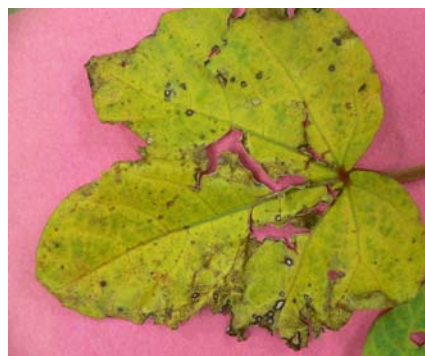
Figure 6. Chlorotic appearance of leaves exhibiting Bacterial Blight.