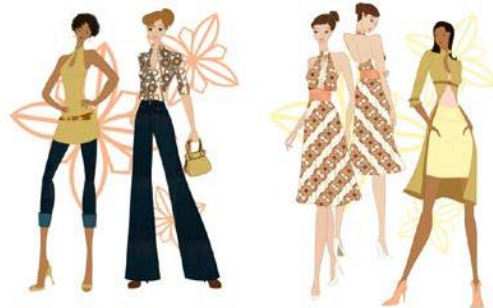
Illustration outfit drawn on a model/croquis

Jewelry Design – flats need to include technical aspects of a piece of jewelry including clasps, crimp beads, cord or wire, jump rings, etc.