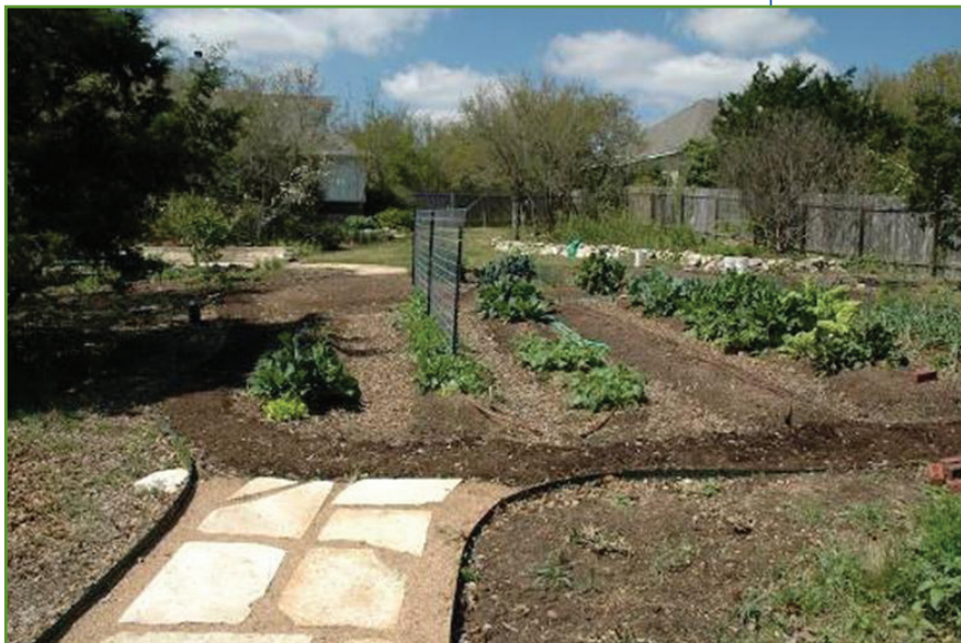
Figure 1. A successful garden begins with a good design.

Do not plant vegetables under the branches of large trees or near shrubs because they rob vegetables of food and water.