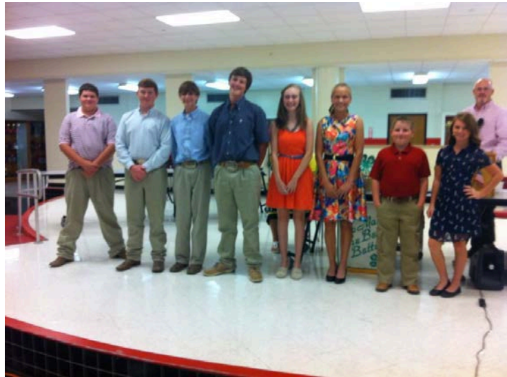
Pictured above is the newly elected 2013-2014 Council Officer team at the 2013 Austin County 4-H Banquet. Congratulations!